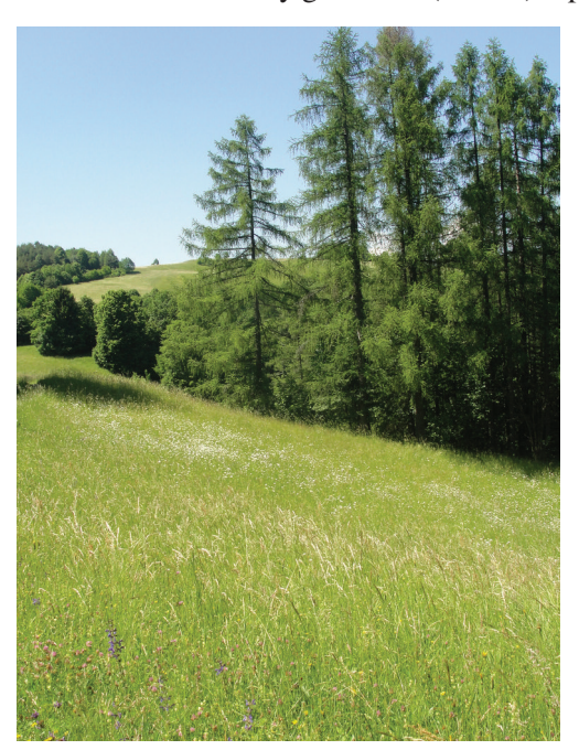
Fig. 3: Locality of Leskov vrh, Šentvid plateau (Locality B) (May, 2011).

One specimen of this local and threatened species was observed on 14<sup>th</sup> of August 2011 on extensive dry grassland (Loc. B). Species is most common at middle altitudes,