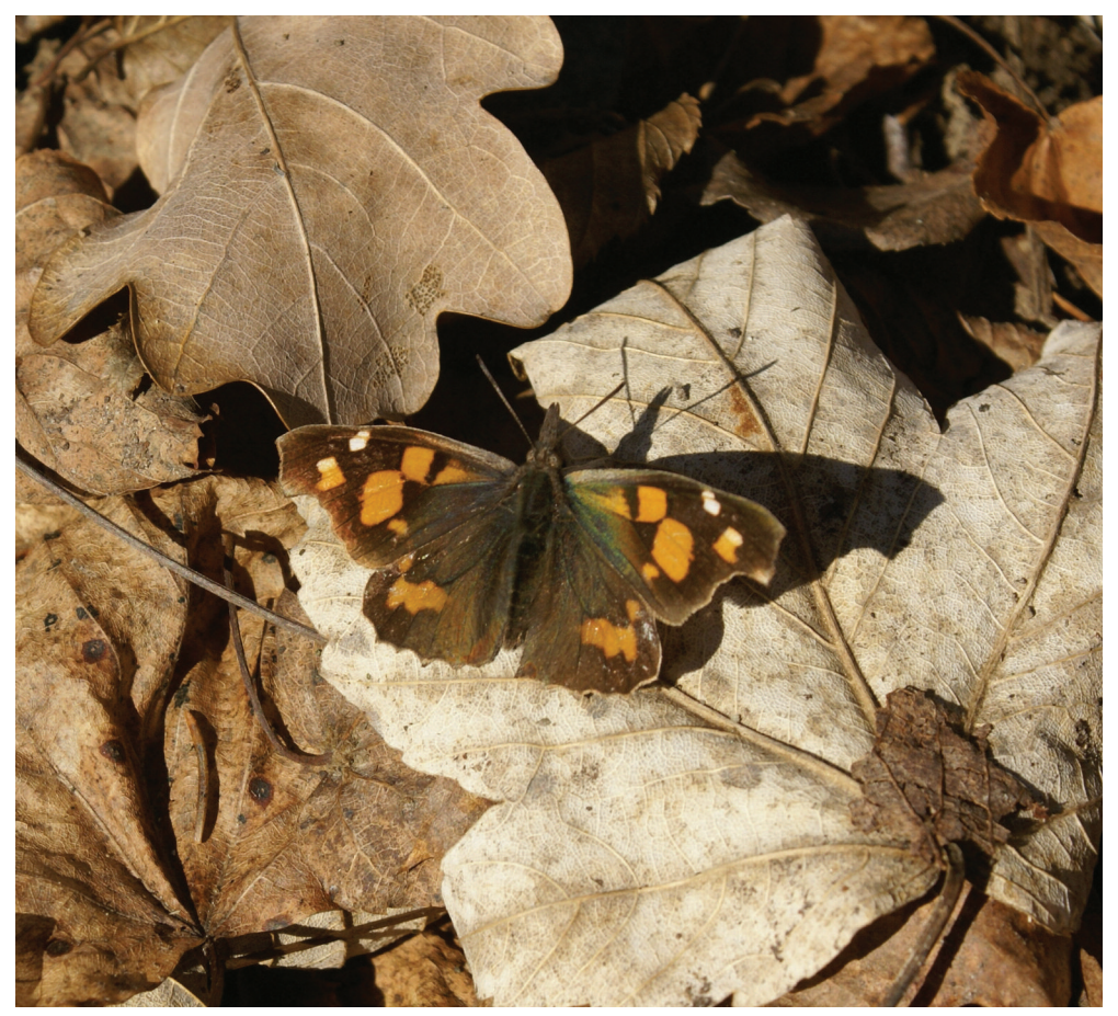
Fig. 4: Libythea celtis found on 25<sup>th</sup> of December 2011 near village Polje. (Foto: G.Torkar).

Mediterranean plants present, such as Cotinus coggygria and Fraxinus minor . This extraordinary finding in the middle of winter confirms a mild climate and the presence of temperature inversions on the Šentvid plateau (Mavrič, 2009; Ogrin, 1996). This is also one of the most northern findings of this species in Slovenia.