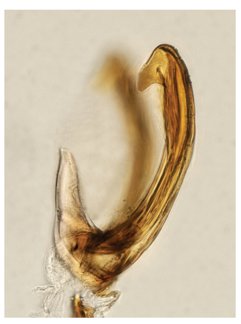
Fig. 7: H. hamatus – aedeagus (lateral view)

slightly lamella-shaped enlarged in distal half and with lateral margins concave below this enlargement. H. callisto is only known from tropical Africa (Republic of Congo) (Zahniser, 2013). H. sellatus is clearly distinguishable by the non-hooked aedeagus shafts, while in H. lindbergi the shafts of aedeagus are hooked, but much slenderer and with outer margins convex. The latter is only known from the Cape Verde Islands.