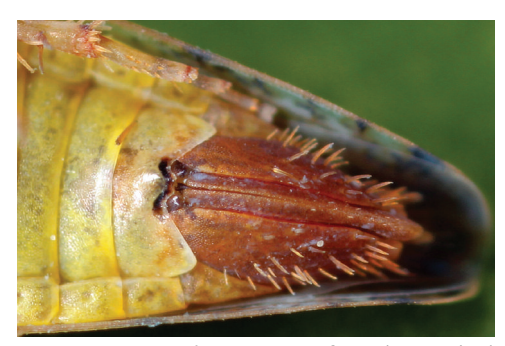
Fig. 4: H. hamatus – female genital segment