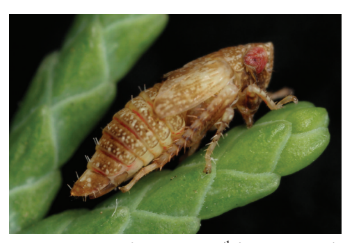
Fig. 10: H. hamatus – 5<sup>th</sup> instar nymph feeding on cypress leaves