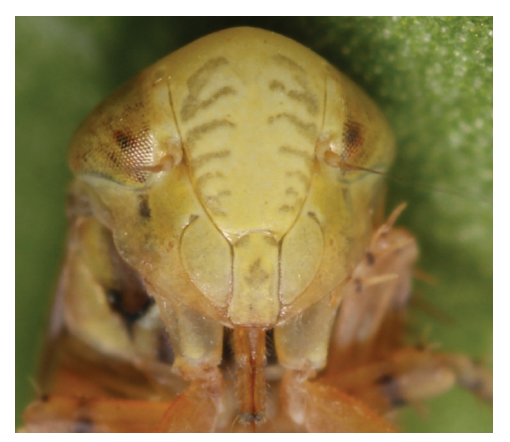
Fig. 5: H. hamatus – head (frontal view)