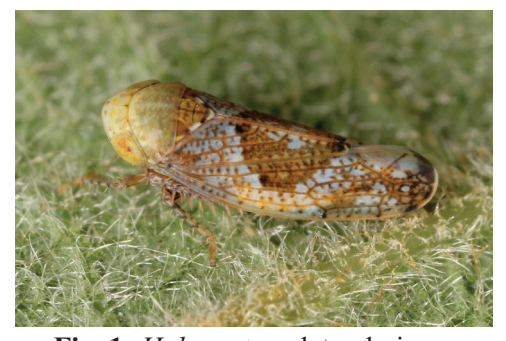
Fig. 1: H. hamatus - lateral view

Female genitalia (Fig. 4): caudal margin of 7<sup>th</sup> sternite concave medially with an emarginated black process.