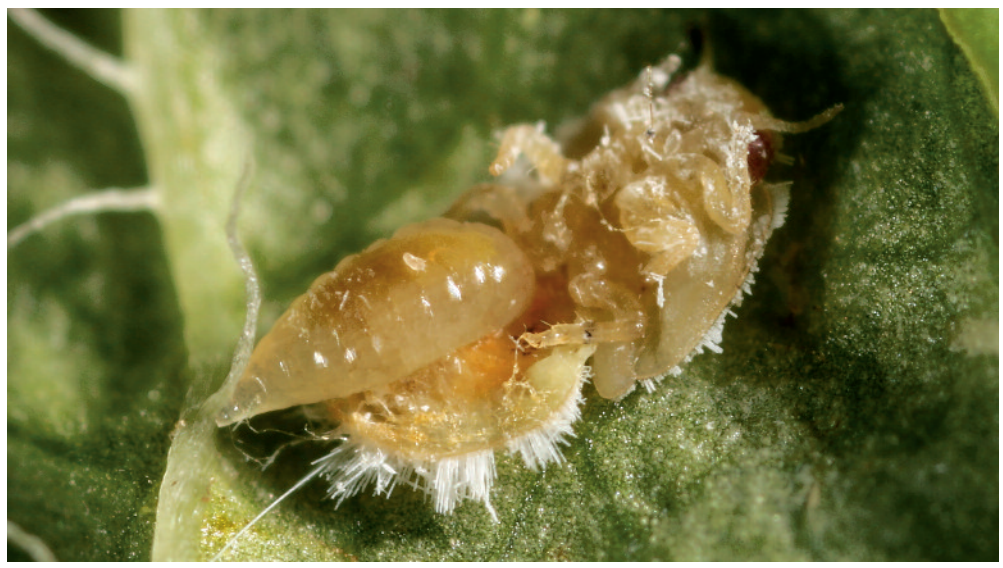
Fig. 10: larva of Tamarixia upis on the lower side of a nymph of T. foersteri (turned upside down)

some of his followers (PUTON, 1899; OSHANIN, 1908; HOUARD, 1909), who considered it as a synonym of T. flavipennis Foerster. This uncertainty was later clarified by ŠULC (1913) who confirmed T. foersteri as a valid species. In contrast, there were no