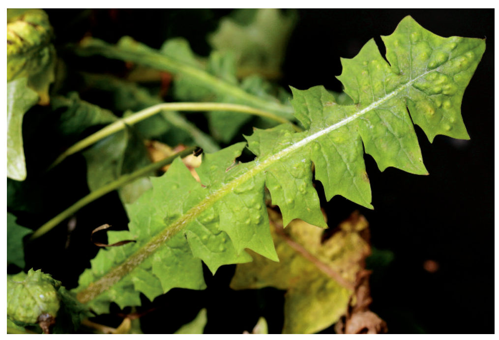
Fig. 3: A leaf of A. foetida with pit-galls

from this material were prepared according to the slightly modified procedure by HODKINSON & WHITE (1979). Then the nymphs were mounted on two slides (6+4). Also these slides are deposited in the author's insect collection. The slide-mounted immatures were examined under a compound microscope (Nikon Eclipse Ni-U) and imaged with an attached digital camera (Nikon DS-U3). Measurements and counts were performed in the Nikon NIS Elements Documentation software.