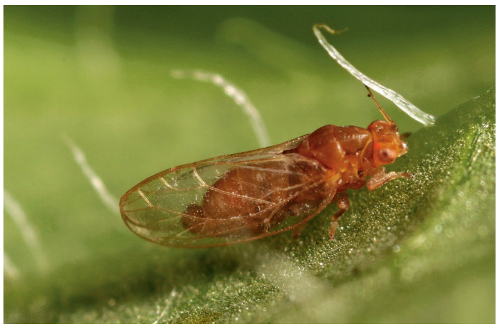
Fig. 7: T. foersteri - a male