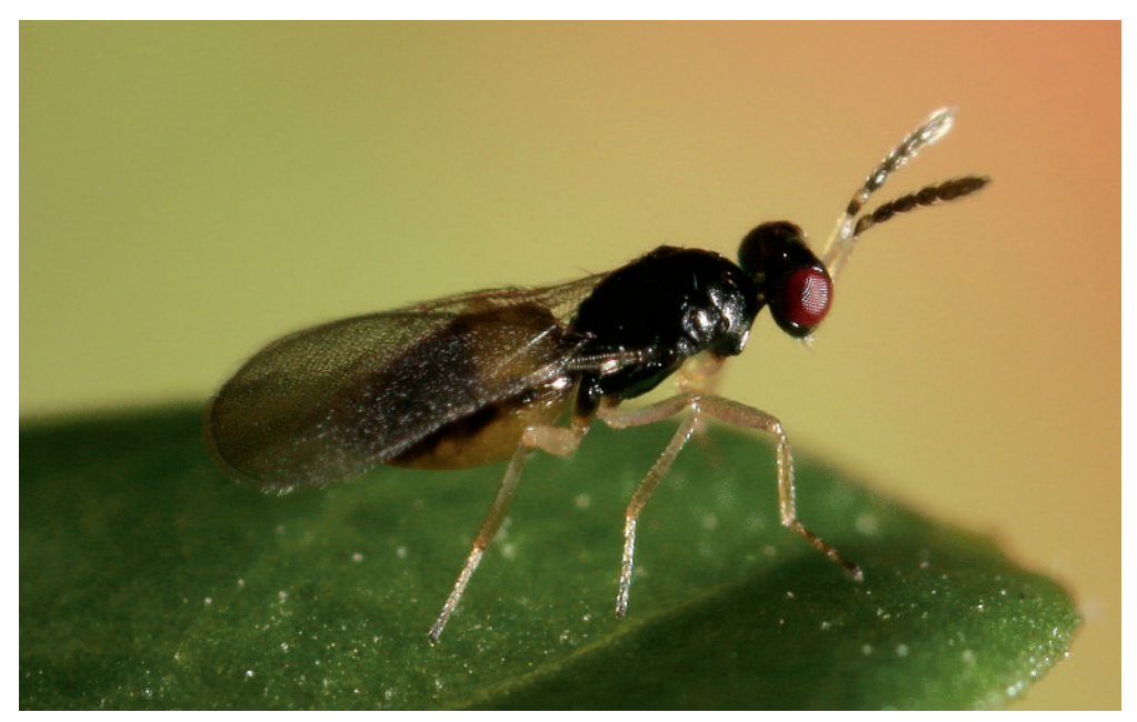
Fig. 11: Tamarixia upis - a female (size: ~ 1,0 mm)