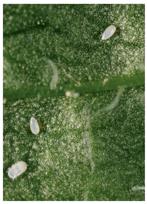
Fig. 5: T. foersteri - deposited eggs in pit-galls on the lower leaf side and a 1<sup>st</sup> instar larva

Dür, 1871 by DOBREANU & MANOLACHE (1962) and ŠULC (1913). The main diagnostic external characters are: a reddish orange body that may be slightly more brownish in males; relatively short and stout subparallel genal cones that are hardly half as long as the vertex; wings light yellowish with asymmetrically rounded apices, surface spinules moderately dense leaving only very narrow spinule-free bands along the veins; genital structures of the male and the female exactly as figured in DOBREANU & MANOLACHE (1962). The most distinctive characters for separating this species from the other representatives of the T. dispar -group ( T. dispar Löw, 1878, T. proxima Flor, 1861, T. megacerca Burckhardt, 1983 and T. tatrensis Klimaszewski, 1965) are the male paramere with only a weak subapical constriction and the shape of the distal segment of the aedeagus with a broad terminal part and a distinctive subapical apophysis on the ventral side (cf. BURCKHARDT, 1983).