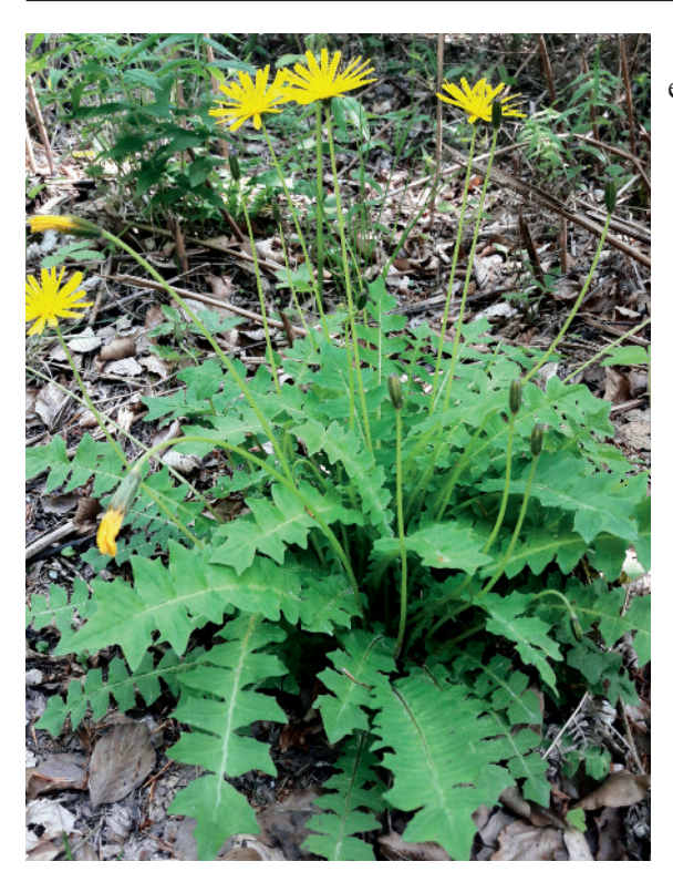
Fig. 2: Aposeris foetida , a flowering plant