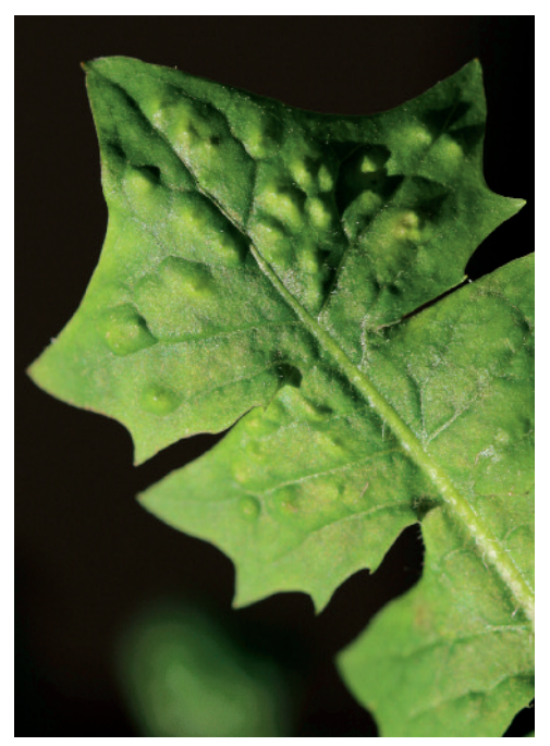
Fig. 4: Close-up of a leaf with pit-galls (upper side)