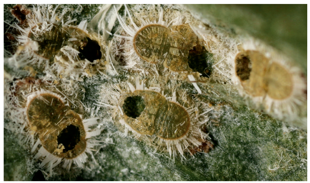
Fig. 9: Parasitized immatures of T. foersteri