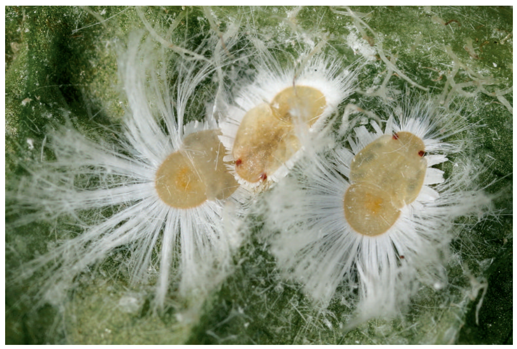
Fig. 6: T. foersteri - fifth instar immatures

Fifth instar immature (Figure 6). Body flattened, elongate ovoid; upper side more or less uniformly pale to ochrous yellow, getting some cast of orange with the age, especially in the middle of the abdomen; eyes red. Body margin with conspicuous white wax filaments of two types and sizes: the shorter ones on wing-pads are about 1/4 as long as the body width and collated in flattened waxy rays; very long, dense and thin rays of waxy filaments emerging from abdomen margins that may exceed the length of the body; on the head, there is a mixture of waxy filaments of both types.