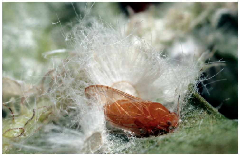
Fig. 8: T. foersteri - a female