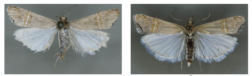
Fig. 1: Euchromius ocelleus (Haworth, 1811): A – Slovenia, Štajerska, Kozjanski park, Župjek, Gradišče (Kozje), 11<sup>th</sup> Sept. 2012, male, Gomboc S. leg.; B – Croatia: Krk Island, Baška, Sv. Ivan, 1<sup>st</sup> July 2007, female, Gomboc S. leg.

E. ocelleus was found in the sand pit, which is exposed to the sun, dry during the day and cooler and humid during the night. The locality is: Kozjanski Park, Župjek, Gradišče (Bizeljsko), Sand pit, close to the Croatian border. This is a ruderal habitat, produced by mining of silicate sand. The habitat consists of pioneer vegetation,