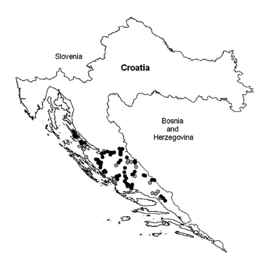
Fig. 1. Distribution of Dalmatian Ringlet ( P. afra dalmata ) in Croatia. Grey spots represent old records, black spots represent new ones.