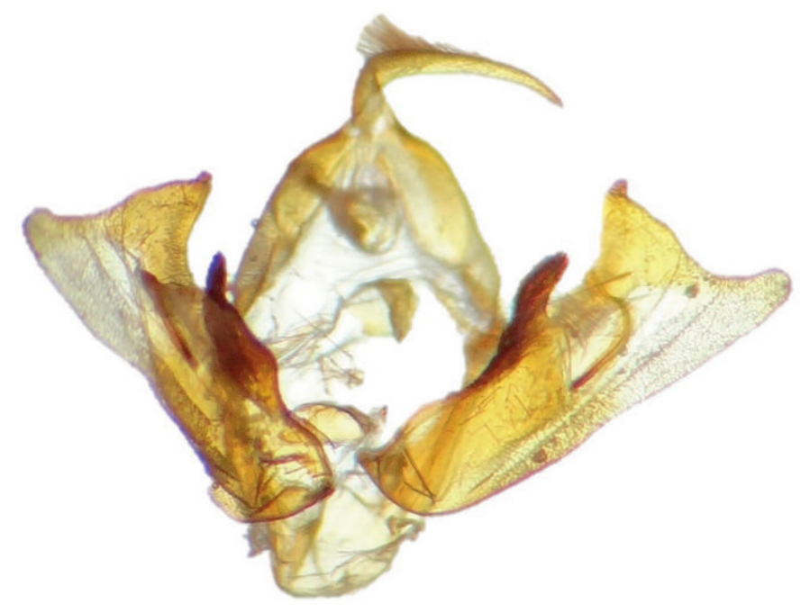
Fig. 3. Male genitalia of Epipsilia grisescens from Mt. Zelengora.

Note: A western Palearctic species with fragmented distribution in Europe, in northern Spain, the Alps, Apennines and the Balkans. This xeromontane species inhabits open, dry, rocky habitats of the alpine and subalpine zone. It flies between June and September. Caterpillars feed on different grasses. This is the only species of the genus Epipsilia present in Bosnia and Herzegovina, known from Kalinovik and Jablanica (Rebel 1904). A similar species, Epipsilia latens (Hübner, 1809) is present in nearby countries, so the correct species identification was confirmed by the examination of the male genitalia (according to Fibiger 1997) (Figure 3). This is a rare and local species, with a limited number of records in the northern Balkans, and as such, is included in this manuscript.