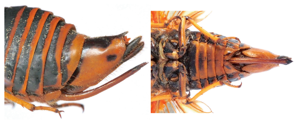
Fig. 7: Female genitalia of Cicadetta concinna arachnocepta ssp. nova, left profile, right ventral view.

The habitat of the C. c. arachnocepta ssp. nova is in the dry grassland above the Treska gorge (Fig. 9). "Suva planina" means a dry mountain. This region is still in a good ecological condition and therefore it is not endangered at the time being. This can of course change very quickly with some extensive development plans. In such a case the further existence of this unique taxon of cicadas would be endangered.