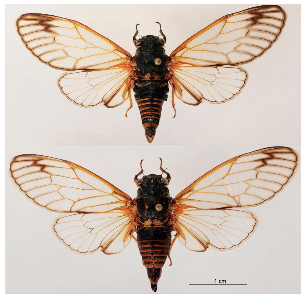
Fig. 2: Cicadetta concinna arachnocepta ssp. nova from Suva planina, Republic of Macedonia, above male (holotype), below female (paratype).