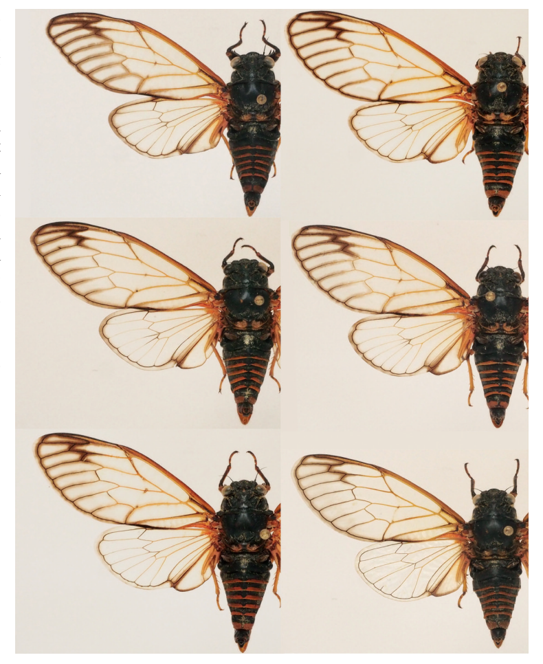
Fig. 3: Males (paratypes) of Cicadetta concinna arachnocepta ssp. nova, left side. (The male shown in Fig. 2 is not shown again and the male from Treska gorge is prepared with closed wings and could not be photographed for this purpose. However, melanistic the colouration of it is also intense.)

front wings - as an infuscation to medial crossveins between ulnar cells 1 and 2 and the adjacent anal cells 1 to 3 (partly 4). The veins surrounding apical cell 1 and partly 2 are dark infuscated. The outer field outside the ambient vein is at the apex dark but gradually lighter toward the hind edge (Fig. 1). In cicadas from Macedonia all veins RA1, RA2, M1 - 4, CuA1 and CuA2 of tegmina are surrounded by dark infuscations. The edge of the wings outside the ambient veins on front wings and the 2A+3A veins of clavus are dark and shaded. Internodal line is on crossings with veins dark emphasised (Fig. 2). The variability of the wing colour pattern in the Macedonian population should not be neglected but only one male specimen out of 11 and one female specimen out of 5 have the pattern resembling the wing pattern of C. concinna concinna .