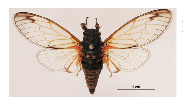
Fig. 1: Habitus of Cicadetta concinna concinna from Krzyżanowice, Poland.