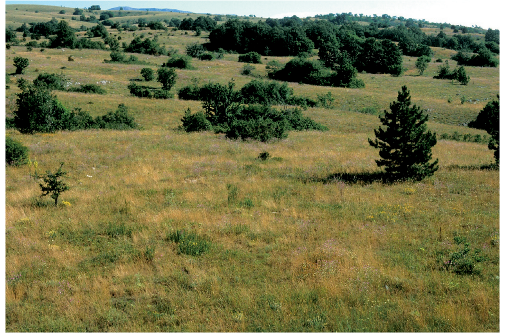
Fig. 9: Habitat of Cicadetta concinna arachnocepta ssp. nova on Suva Planina, Republic of Macedonia.

Among the specimens of C. c. arachnocepta from Suva planina we observed a quite high morphological variability (Figs. 3, 4), what can be a consequence of the