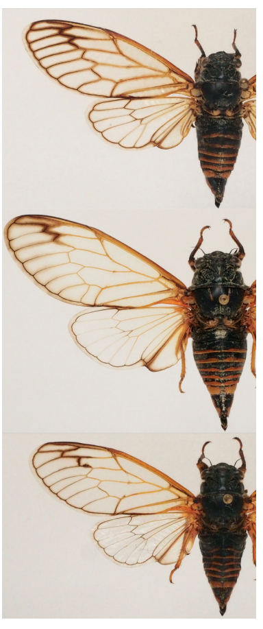
Fig. 4: Females (paratypes) of Cicadetta concinna arachnocepta ssp. nova, left side. (Also here the female shown in Fig. 2 is not shown again and the female from Treska gorge is prepared with closed wings and could not be photographed for this purpose. However, the melanistic colouration of it is also intense.)

The number of apical cells is in Macedonian population as well as in typical Cicadetta concinna concinna usually in front wings 8 and in hind wings 6. However, among the Macedonian specimens in one male out of 7 the number of apical cells on the left front wing is 10 and on the right hind wing 7 and another male has rudimentary median vein M_{3+4} and therefore 5 apical cells on one side of hind wings (Fig. 3). The first female collected in 2000 (see above) has on hind wings on both sides only 5 apical cells, another female has 9 apical cells on the left tegmen and other two females have a normal number 8 and 6 on both sides of the wings (Fig. 4).