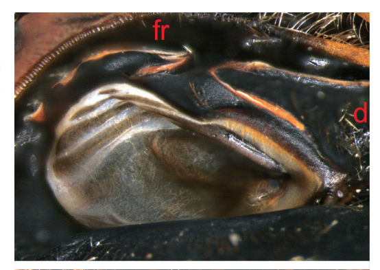
Fig. 5: Abdominal and sternal structures of Cicadetta concinna arachnocepta ssp. nova, above: left timbal, below: male with opercula and meracanthus. fr - frontal side, d - dorsal side, R - tip of rostrum, arrow - pointing to the right meracanthus.