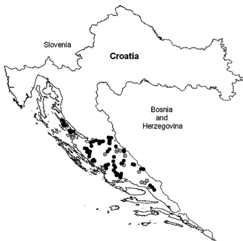
Fig. 1. Distribution of Dalmatian Ringlet ( P. afra dalmata ) in Croatia. Grey spots represent old records, black spots represent new ones.