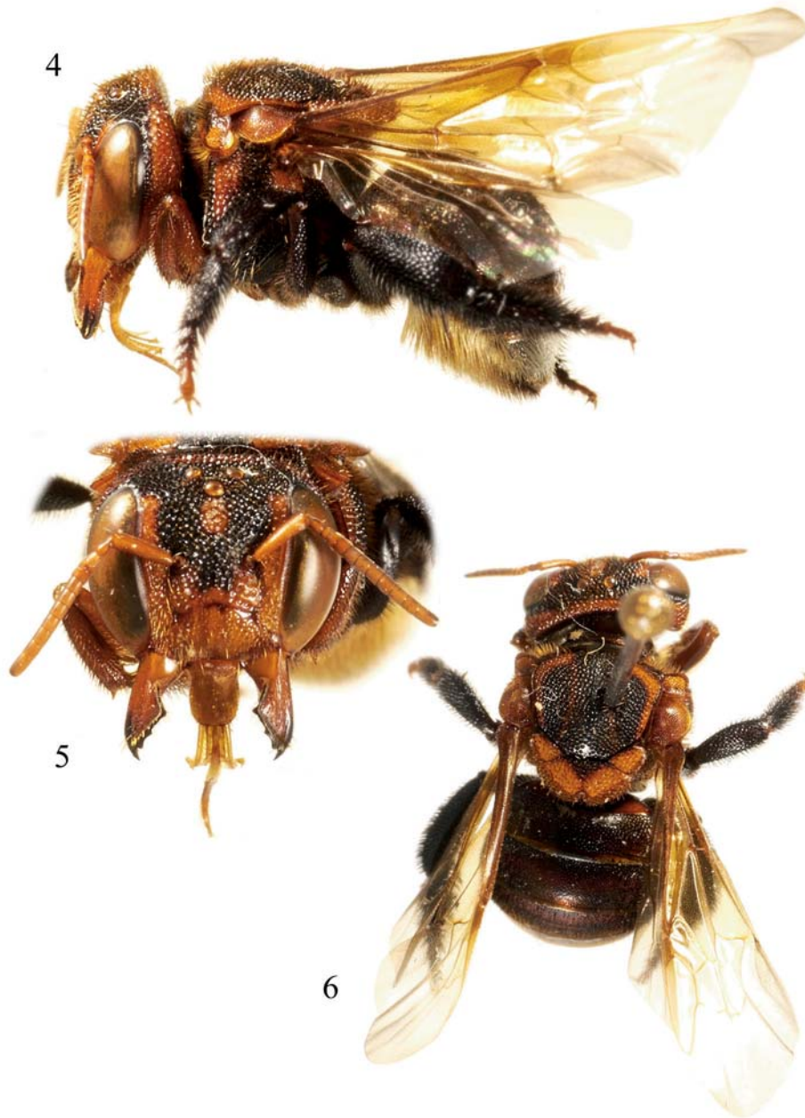
Figs. 4–6: Photomicrographs of female of Anthidiellum (Ranthidiellum) rufomaculatum (Cameron) from southernmost Peninsular Malaysia (Johore); 4) Lateral habitus; 5) Facial aspect; 6) Dorsal habitus.