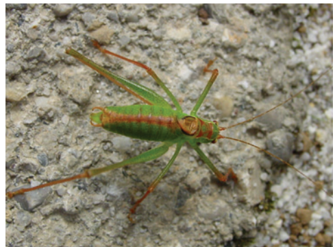
Fig. 4: Same as fig 3, dorsal view.

Sl. 3: Odrasli samček L. punctatissima , stranski pogled, z lokalitete Gornje Vreme pri Divači.