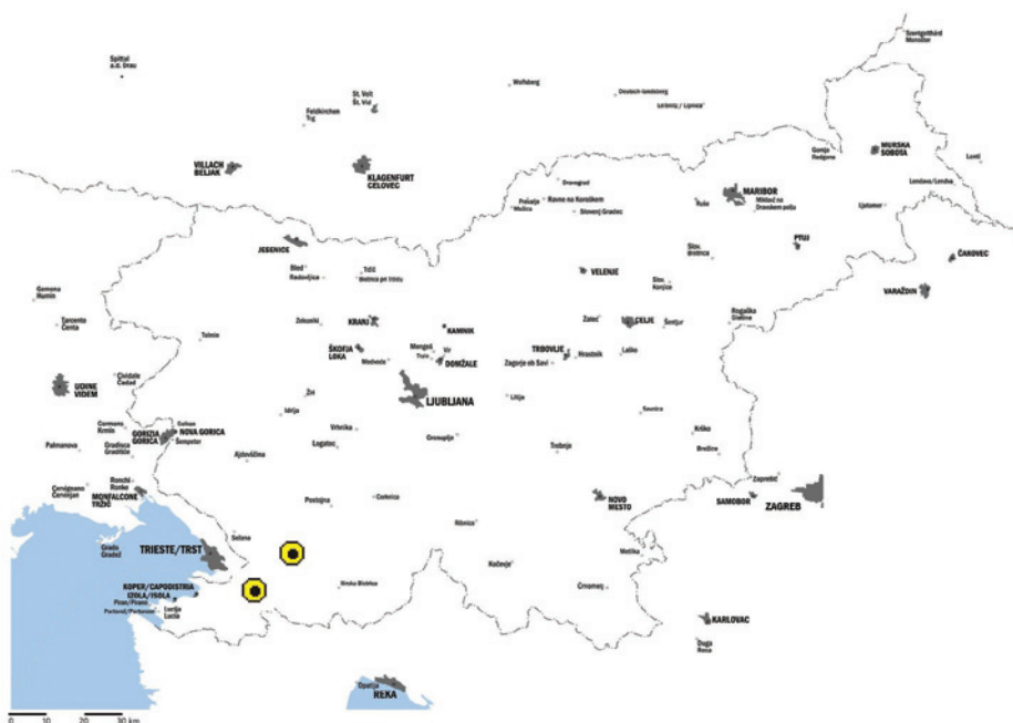
Fig. 1: Localities of L. punctatissima in Slovenia.

SI. 1: Karta Slovenije z označenima najdiščema vrste L. punctatissima .