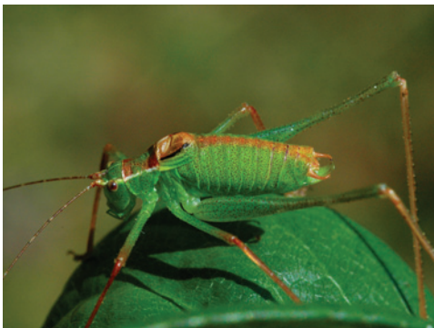
Fig. 3: Adult male of L. punctatissima , lateral view, from the locality Gornje Vreme near Divača.

Sl. 3: Odrasli samček L. punctatissima , stranski pogled, z lokalitete Gornje Vreme pri Divači.