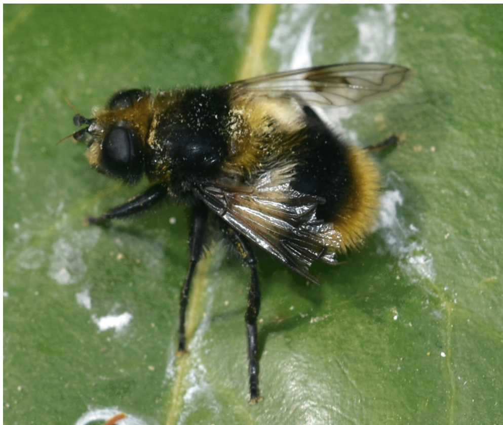
Fig. 1: Adult male of Mallota fuciformis found in Ponikva pri Žalcu, Slovenia