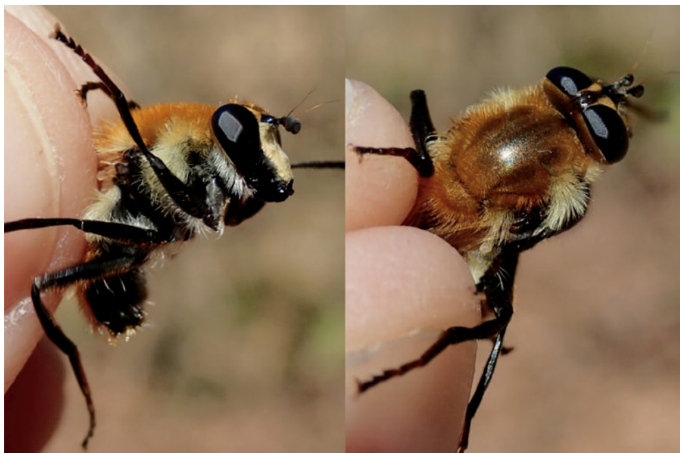
Fig. 1: Criorhina floccosa , female habitus.

Criorhina floccosa (Meigen, 1822) (Fig. 1)