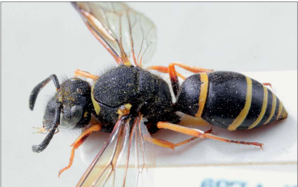
Slika 44: Odynerus spinipes , samica z Lukovice pri Brezovici.