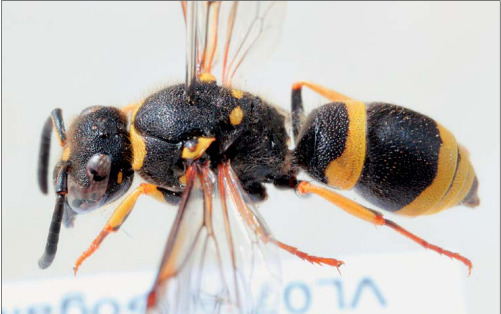
Slika 11: Ancistrocerus longispinosus , samica iz Škrbine na Krasu.