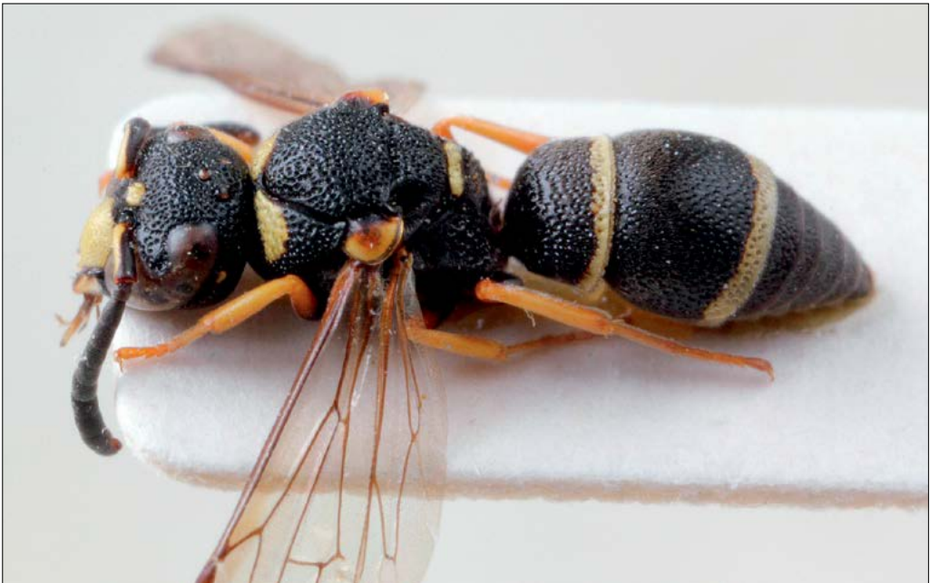
Slika 48: Stenodynerus steckianus , samec s Trstelja na Krasu.