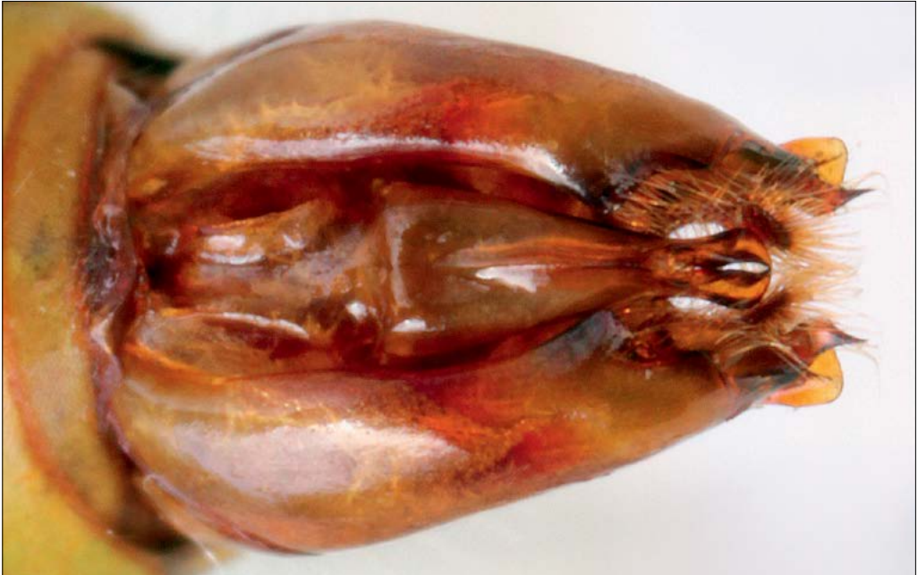
Slika 82: Dolichovespula omissa , genitalije samca.