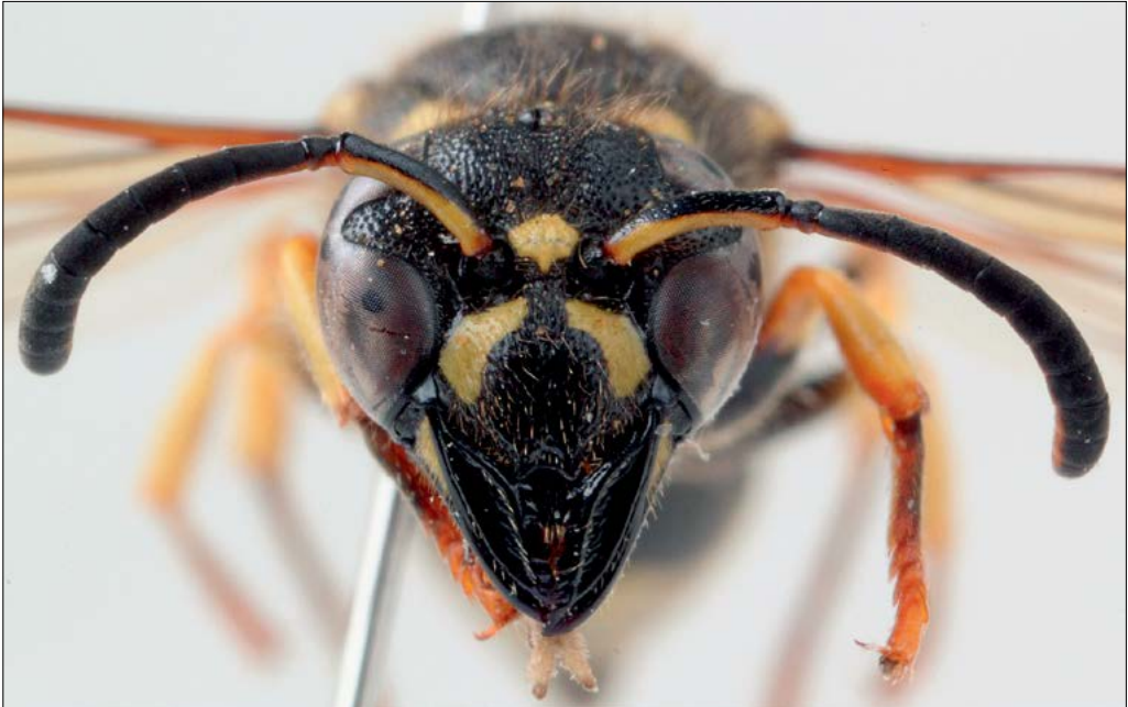
Slika 15: Ancistrocerus parietinus , obraz samice iz Sel na Krasu.