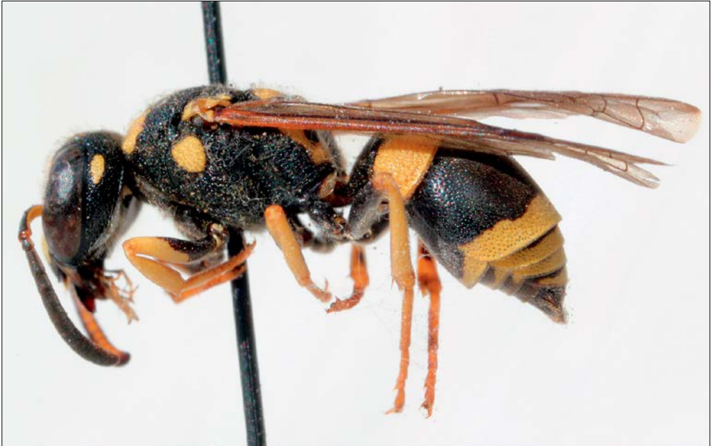
Slika 7: Ancistrocerus auctus , samica iz Podčetrтка, ujeta 1. avgusta 1939.