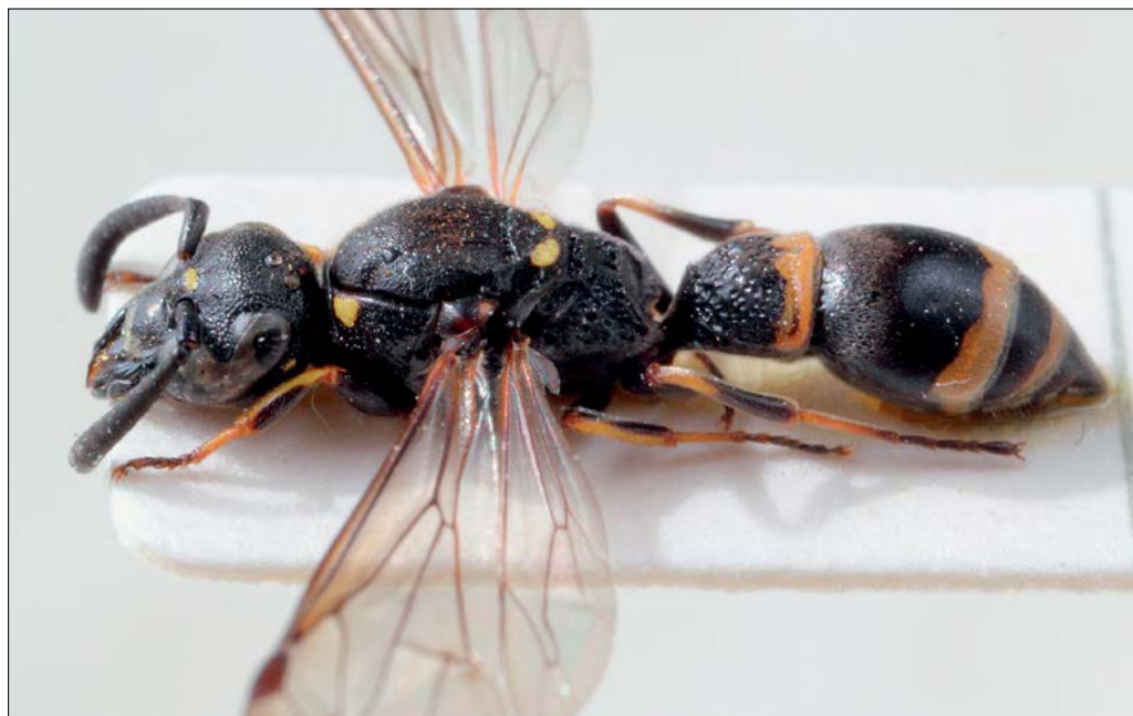
Slika 50: Symmorphus bifasciatus , samica z Lukovice pri Brezovici.

Figure 49: Stenodynerus xanthomelas female from Podčetrtek, collected 5 July 1938.