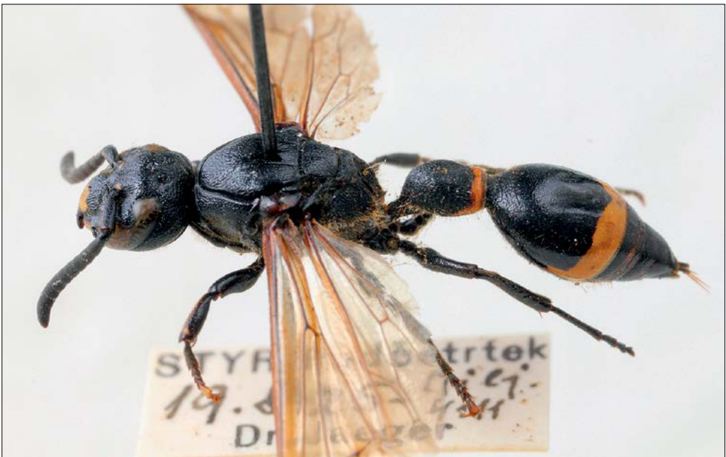
Slika 22: Discoelius zonalis , samica iz Miljane (Hrvaška), 19. avgusta 1925 jo je ujel E. Jaeger.