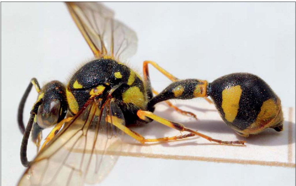
Slika 27: Eumenes papillarius , samica z Lukovice pri Brezovici.