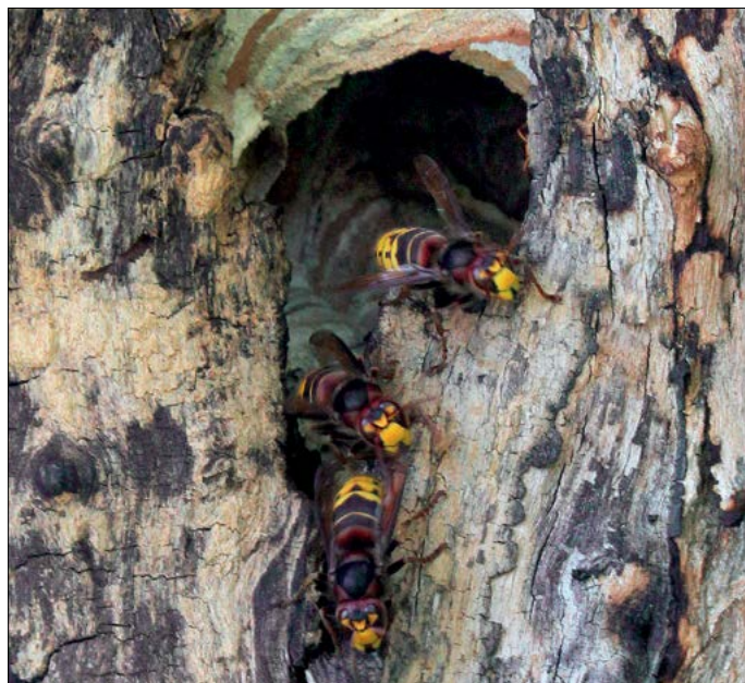
Slika 68: Tri delavke pred vhom v gnezdo sršenov ( Vespa crabro ) v ožganem drevesu. Škocjan, Kras, 30. september 2017.