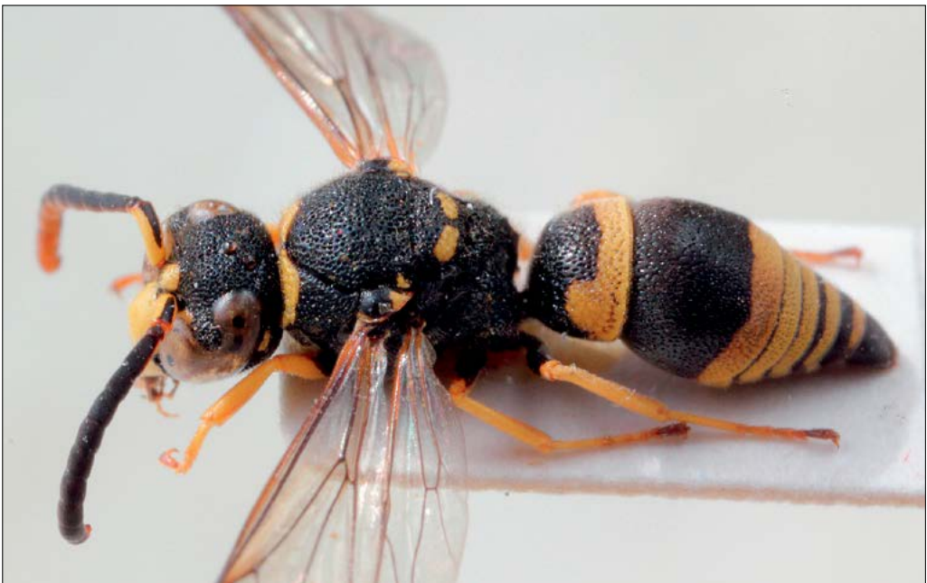
Slika 16: Ancistrocerus renimacula , samec iz Movraža v Istri.