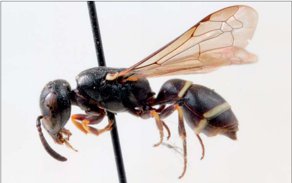
Slika 38: Microdynerus nugdunensis , samica iz Podčetrтка, ujeta 18. junija 1936.

Podčetrtek, WM41, 2. 7. 1934, 1♂, SCHL (schloss/grad) 7. 7. 1934, 1♀, E. Jaeger leg., PMSL