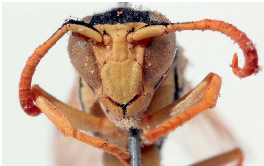
Slika 63: Polistes foederatus , obraz samca iz Podčetrtek.