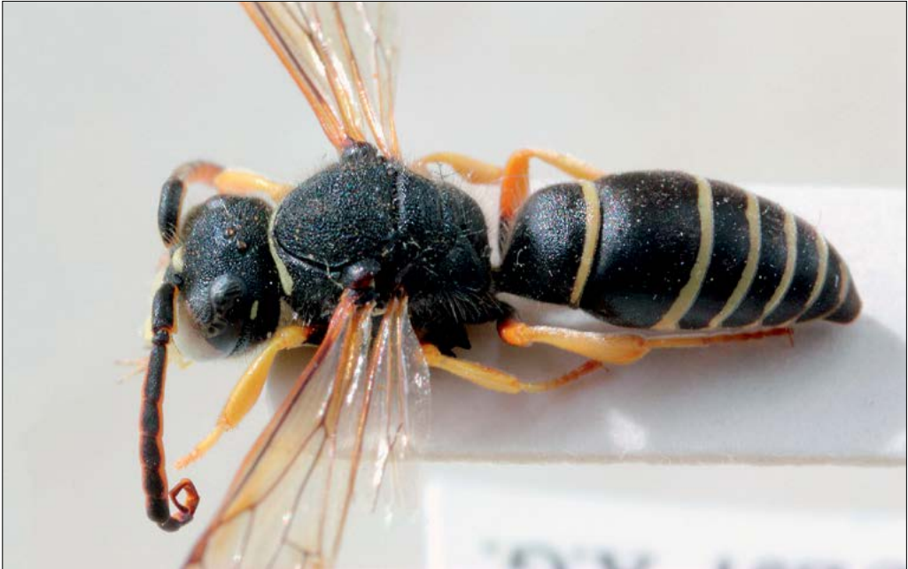
Slika 43: Odynerus poecilus , samec iz Gorjanskega na Krasu.