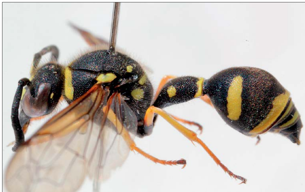
Slika 24: Eumenes coarctatus , samica iz Sel na Krasu.