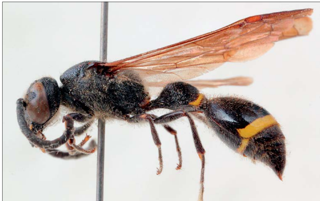
Slika 23: Discoelius zonalis , samec iz Podčetrтка, ujet 18. avgusta 1945.

Podčetrtek, WM41, 18. 8. 1945, 1♂, OL (Olimje) 2. 9. 1945, 1♂, E. Jaeger leg., PMSL