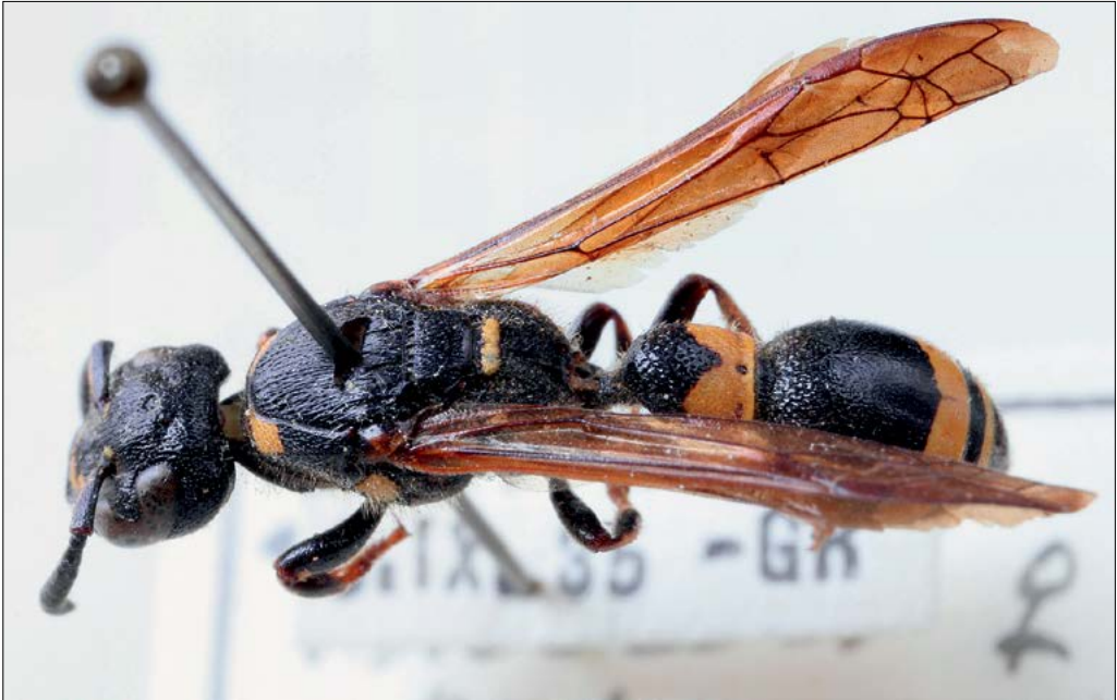
Slika 21: Discoelius dufourii , samica iz Podčetrka, ujeta 3. septembra 1935.