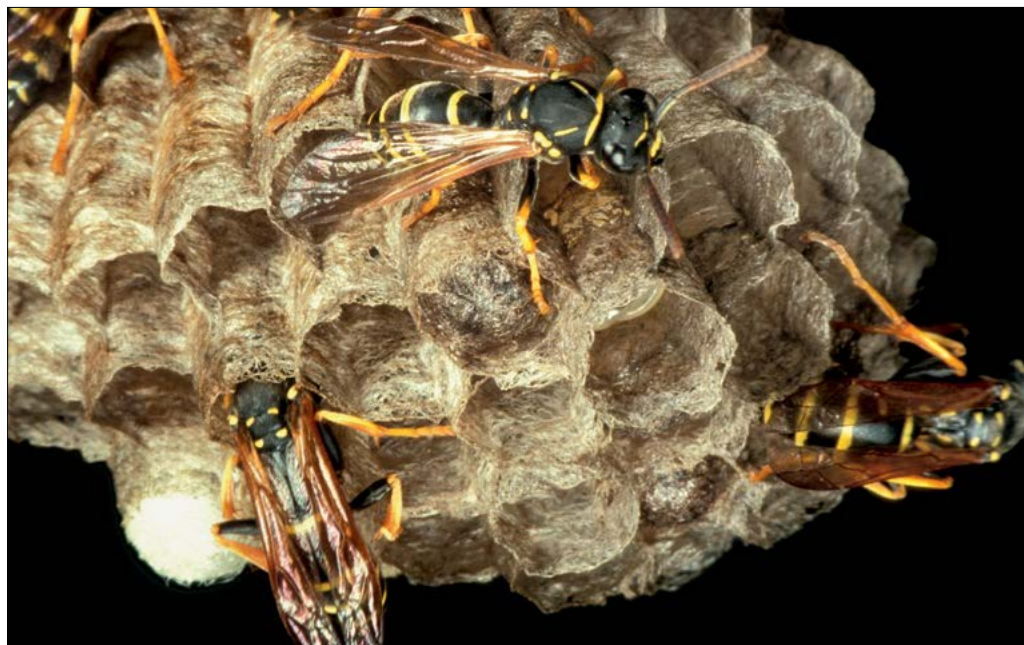
Slika 58: Polistes biglumis , gnezdo z delavkami, 24. julij 1992.