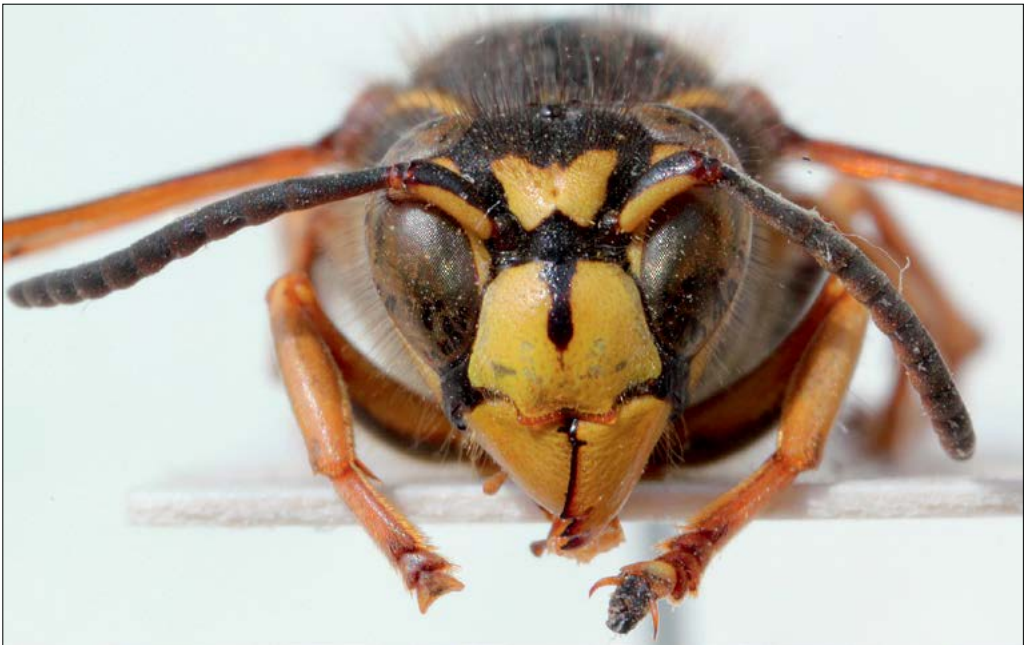
Slika 79: Dolichovespula media , obraz samice z Lukovice pri Brezovici.