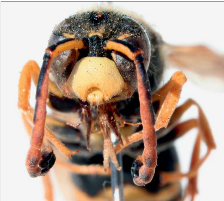
Slika 46: Paragymnomerus spiricornis , obraz samca.