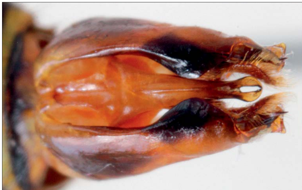
Slika 84: Dolichovespula saxonica , genitalije samca.