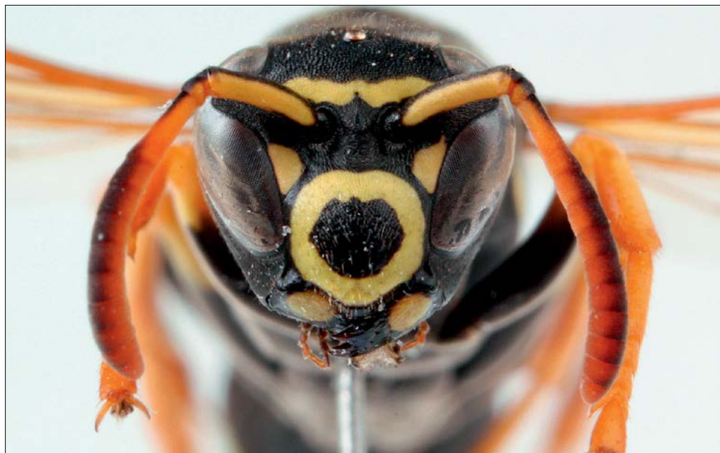
Slika 62: Polistes foederatus , obraz samice iz Sel na Krasu.