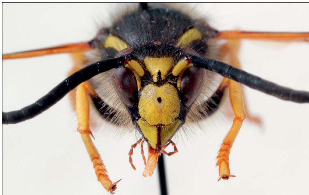
Slika 85: Dolichovespula sylvestris , obraz samca z Nanosa.