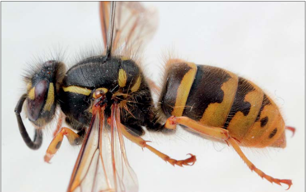
Slika 75: Vespula vulgaris , samica z Brij pri Komnu na Krasu, ujeta 21. aprila 2018.