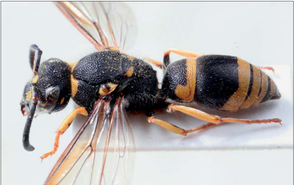
Slika 12: Ancistrocerus nigricornis , samica z Lukovice pri Brezovici, ujeta 8. junija 1991.