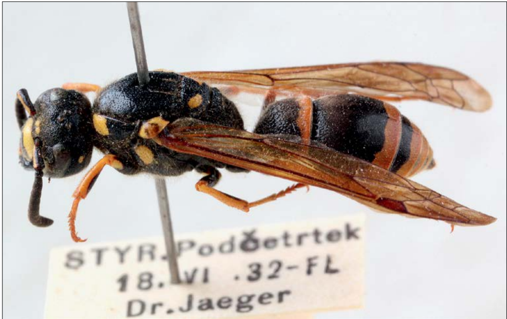
Slika 55: Symmorphus murarius , samica iz Podčetrтка, ujeta 18. junija 1932.