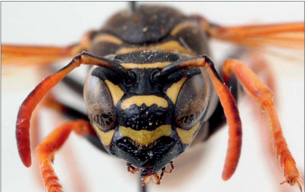
Slika 65: Polistes nimpha , obraz samice s Stražarja nad Igom.