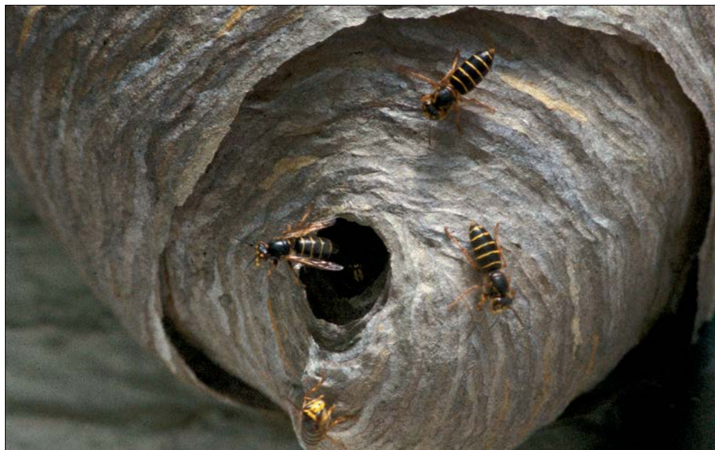
Slika 76: Gnezdo vrste Dolichovespula media na Lukovici pri Brezovici.