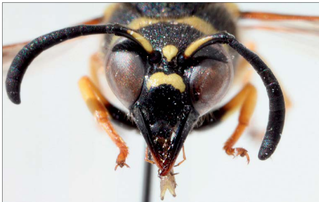
Slika 25: Eumenes coarctatus , obraz samice iz Sel.