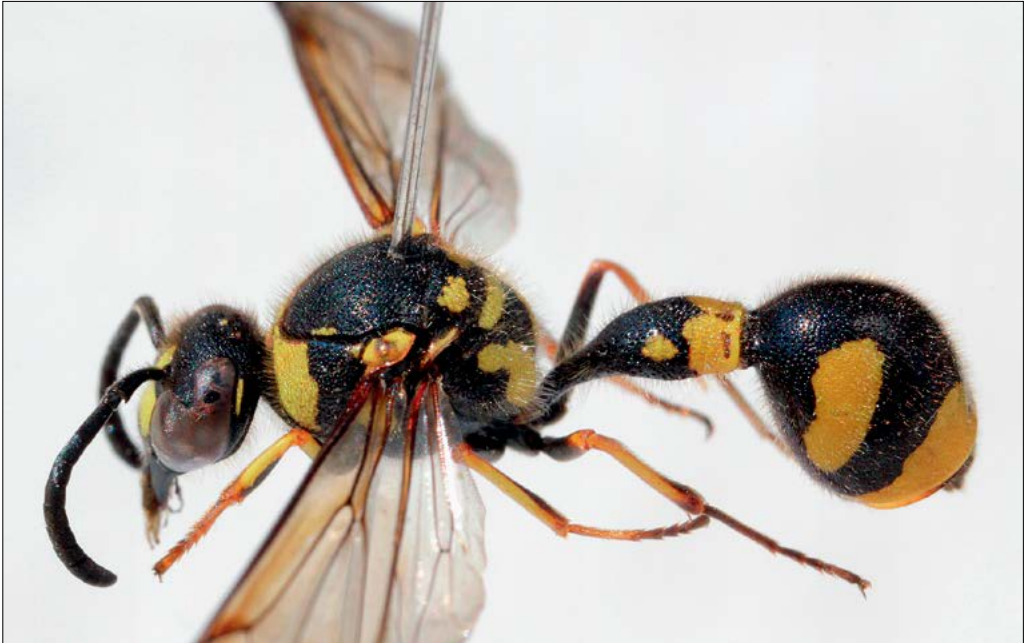
Slika 26: Eumenes coronatus , samica z Brij pri Komnu na Krasu.