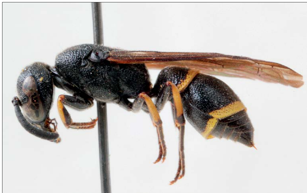
Slika 49: Stenodynerus xanthomelas , samica iz Podčetrтка, ujeta 5. julija 1938.

Figure 49: Stenodynerus xanthomelas female from Podčetrtek, collected 5 July 1938.