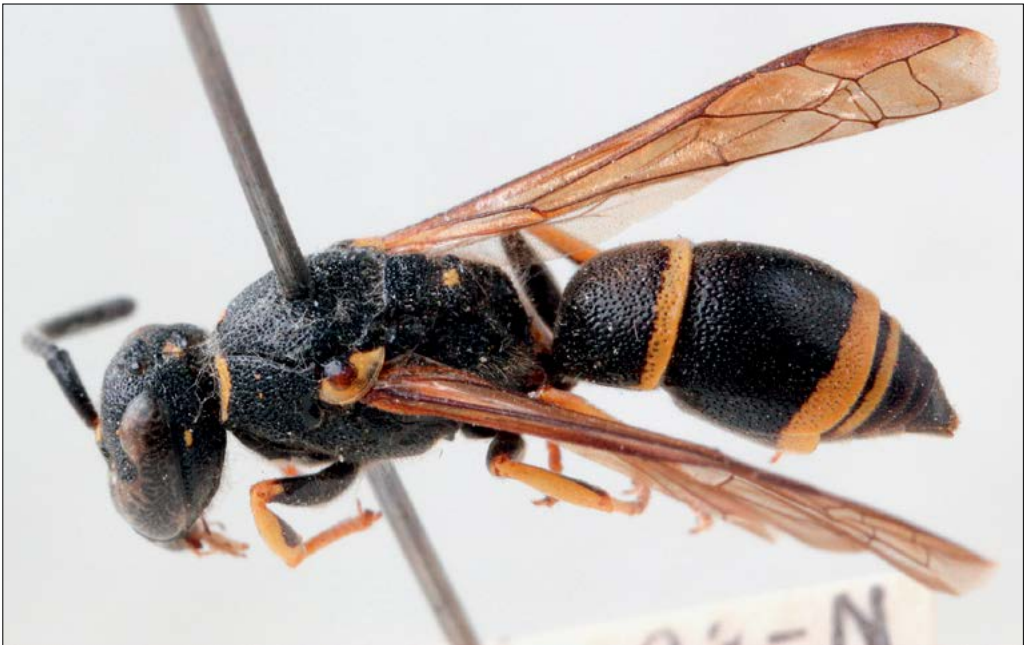
Slika 4: Allodynerus rossii , samica iz Podčetrka, ujeta 31. avgusta 1933.