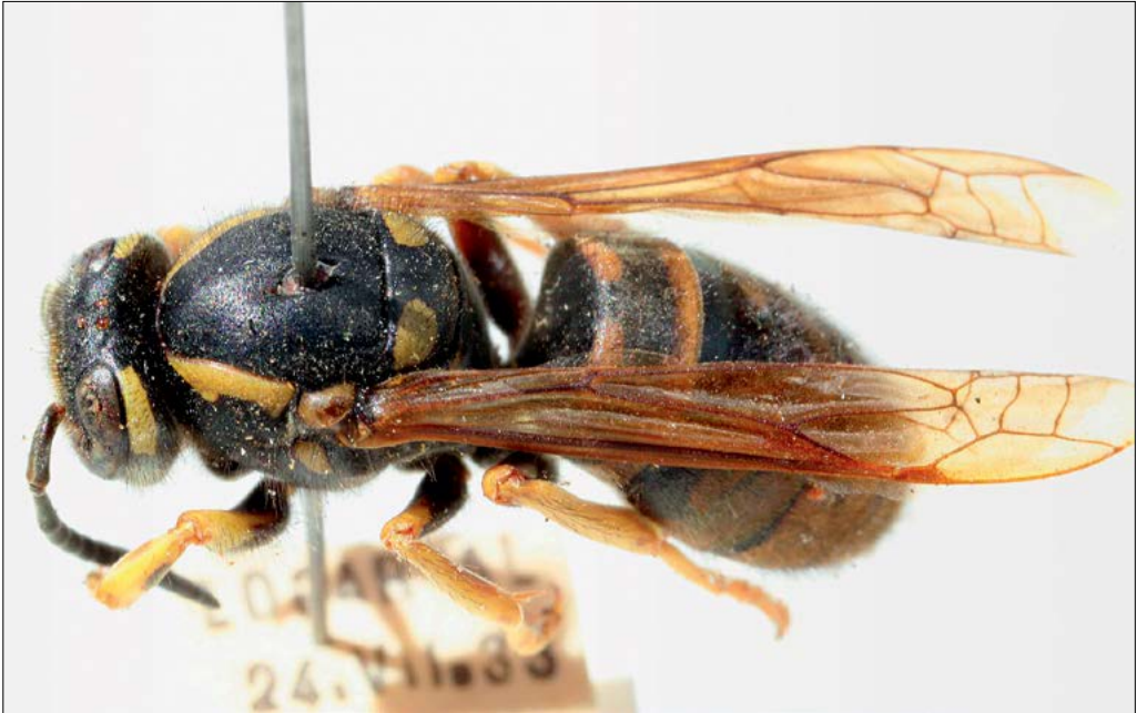
Slika 70: Vespula austriaca , samica iz Logarske doline.