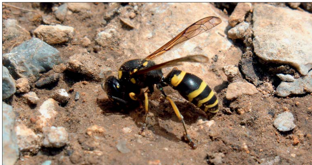
Slika 5: Ancistrocerus parietinus , samica zbira prst za gradnjo gnezda. Sela na Krasu, 24. maj 2020.

Figure 5: Ancistrocerus parietinus female collecting soil for nest construction. Sela na Krasu, 24 May 2020.