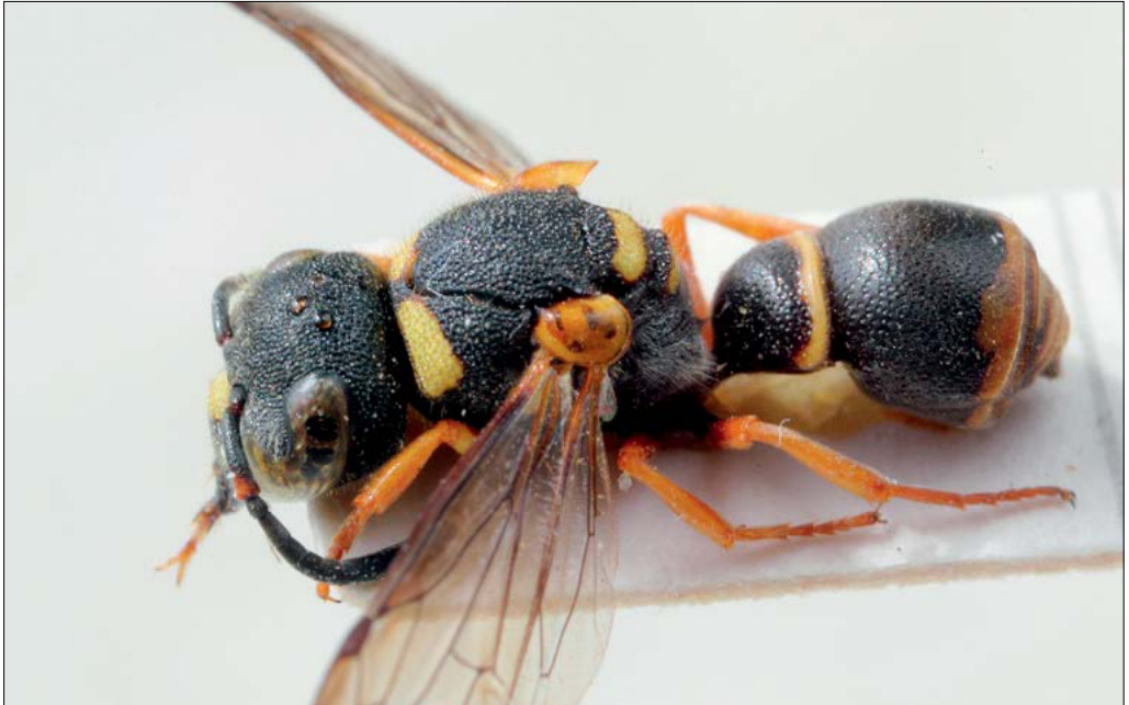
Slika 36: Leptochilus limbiferus , samica iz Ospa v Istri.