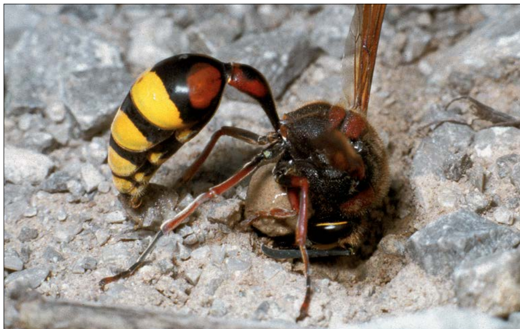
Slika 20: Delta unguiculatum , samica zbira pesek za gradnjo gnezda. Brje pri Komnu, 9. julij 1989.