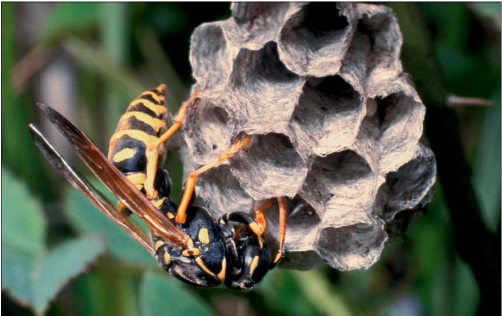
Slika 57: Polistes nimpha , matica na gnezdu. Lukovica pri Brezovici, 4. maj 1989.

Snežnik, 1560 m, VL54, 19. 7. 2018, 1♂, A. Gogala leg., PMSL