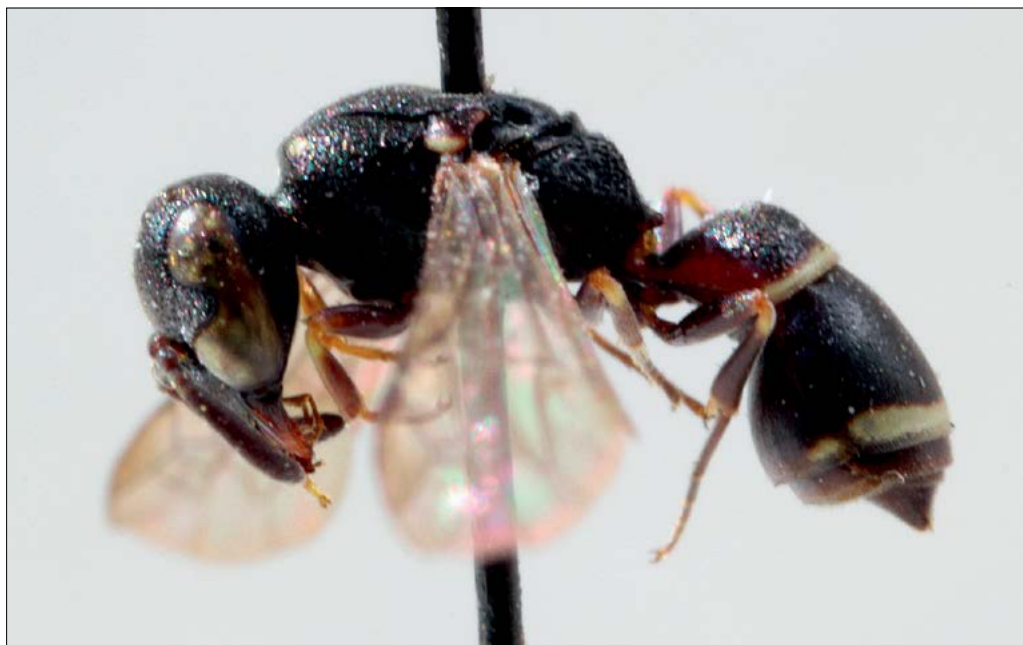
Slika 40: Microdynerus timidus , samica iz Podčetrčka, ujeta 7. julija 1934.