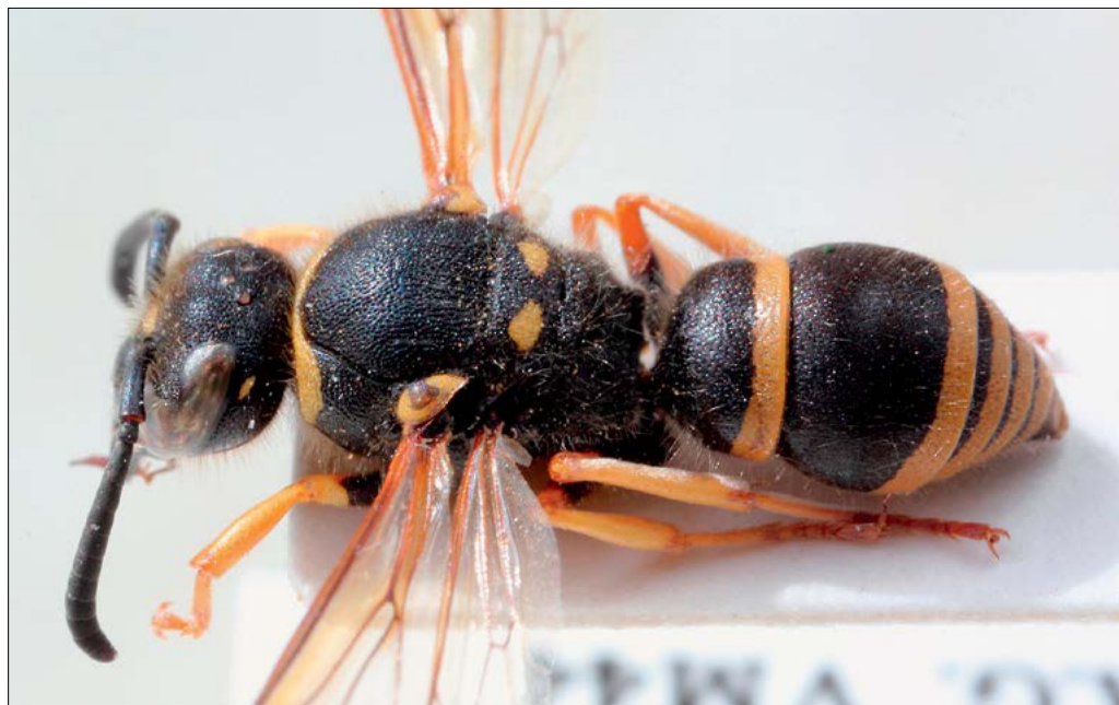
Slika 13: Ancistrocerus oviventris , samica s Košute v Karavankah.