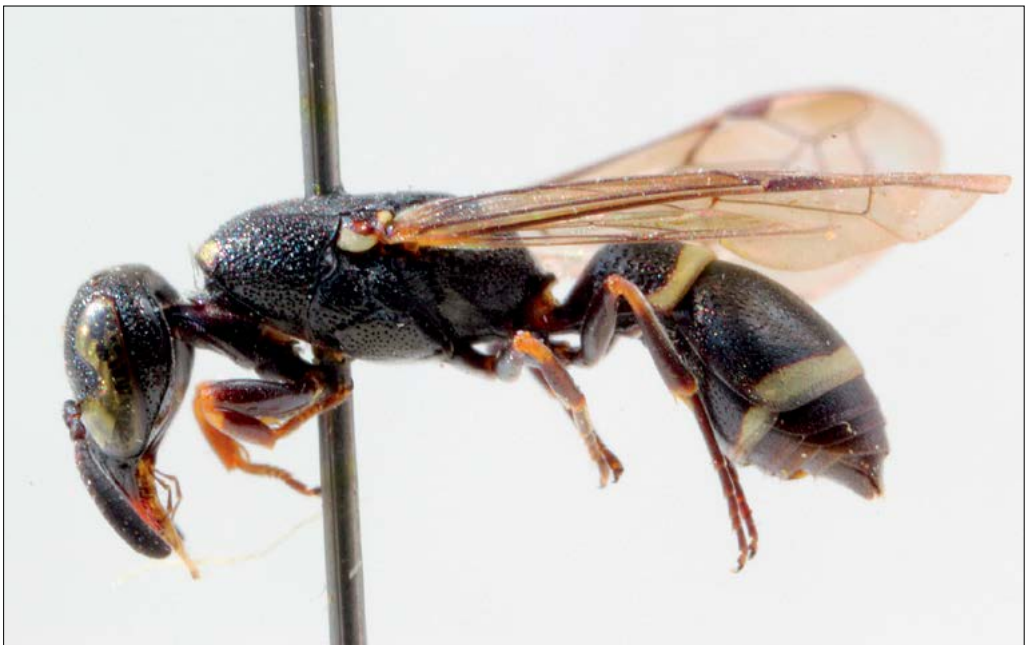
Slika 37: Microdynerus exilis , samica iz Podčetrtek.