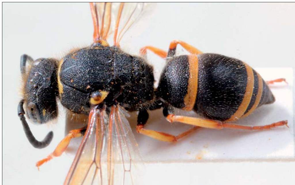
Slika 17: Ancistrocerus scoticus , samica s Tosca v Julijskih Alpah.

Figure 17: Ancistrocerus scoticus female from Mt. Tosc in the Julian Alps.