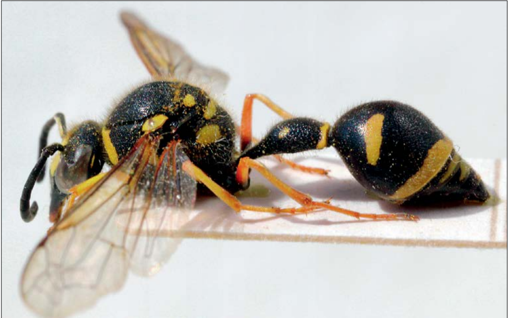
Slika 28: Eumenes pedunculatus , samica z Brij pri Komnu, ujeta 19. avgusta 1990.