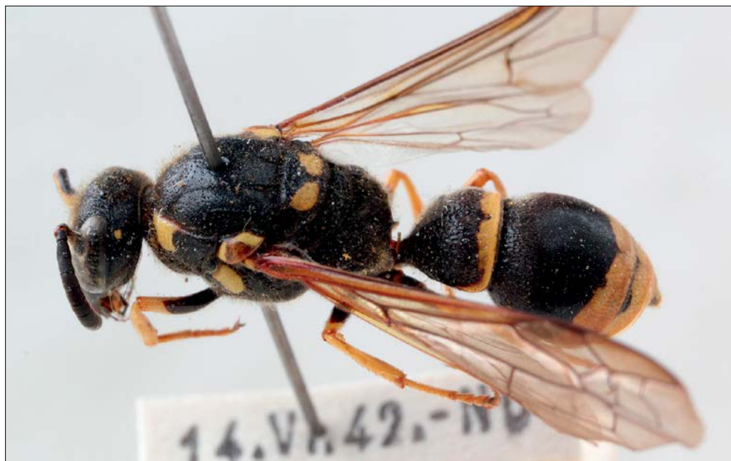
Slika 51: Symmorphus crassicornis , samica iz Podčetrška, ujeta 14. junija 1942.

Figure 51: Symmorphus crassicornis female from Podčetrtek, collected 14 June 1942.