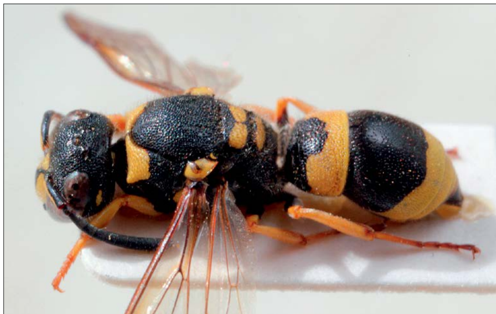
Slika 10: Ancistrocerus gazella , samica iz Pirana v Istri.

Figure 9: Ancistrocerus claripennis female from Podčetrtek, collected 15 July 1938.