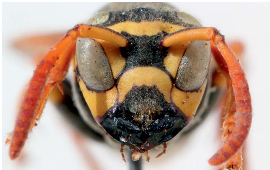
Slika 66: Polistes semenowi , obraz samice iz Olimja pri Podčetrtku, ujete 6. septembra 1932.

Figure 66: Face of Polistes semenowi female from Olimje near Podčetrtek, collected 6 September 1932.