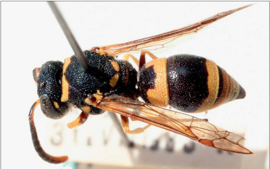
Slika 8: Ancistrocerus auctus , samec iz Podčetrтка, ujet 31. avgusta 1933.