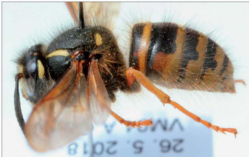
Slika 80: Dolichovespula norwegica , samica iz doline Trente.