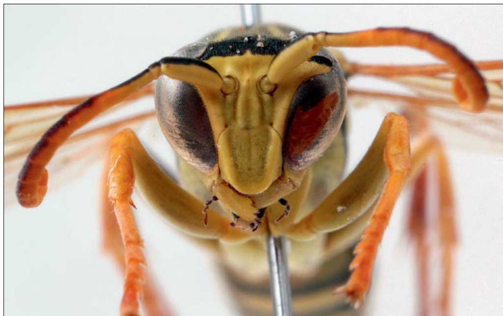
Slika 59: Polistes associus , obraz samca iz Brij pri Komnu na Krasu.