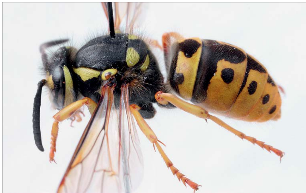
Slika 72: Vespula germanica , samica z Lukovice pri Brezovici, ujeta 8. junija 2019.

Figure 72: Vespula germanica female from Lukovica pri Brezovici, collected 8 June 2019.