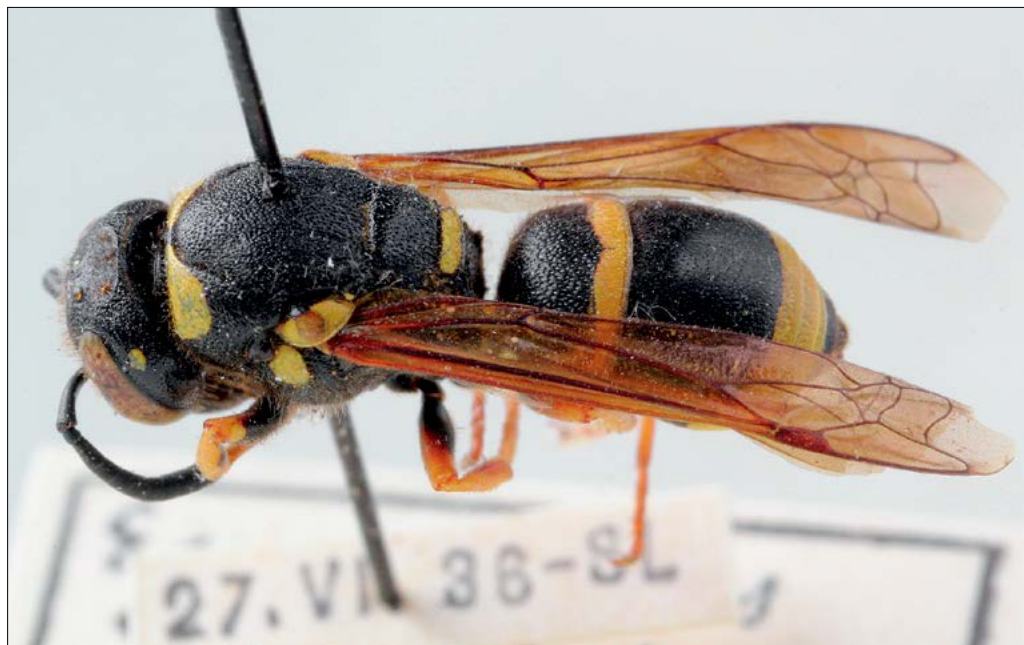
Slika 32: Euodynerus quadrifasciatus , samica iz Podčetrčka, ujeta 27. junija 1936.

Figure 32: Euodynerus quadrifasciatus female from Podčetrtek, collected 27 June 1936.