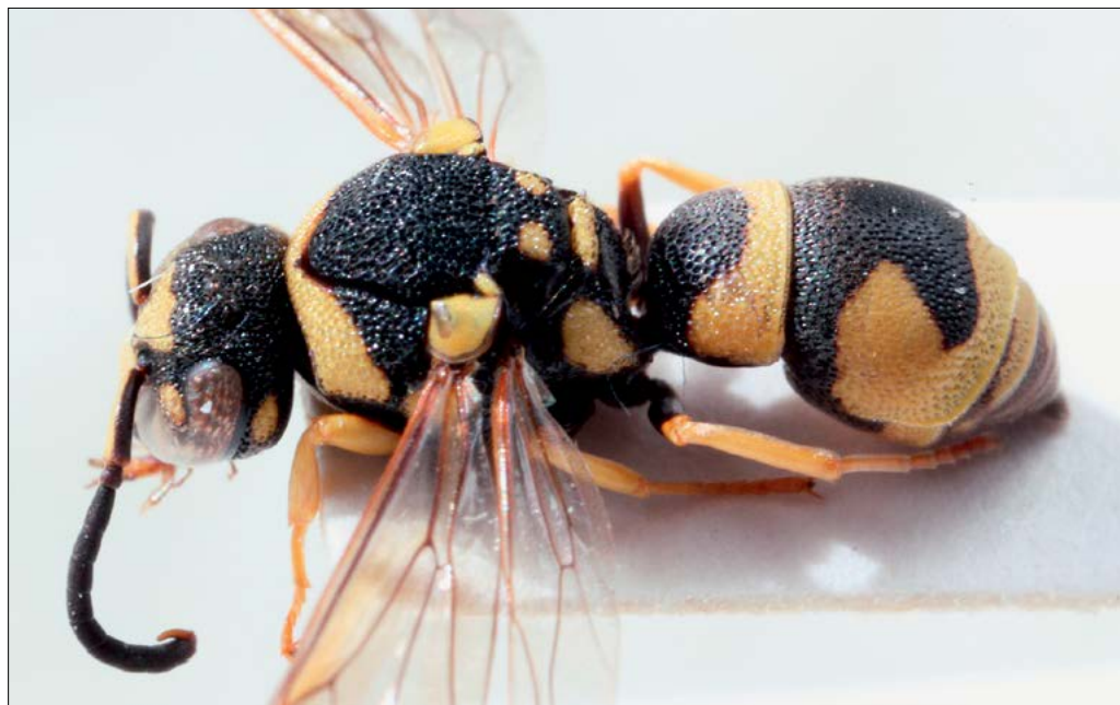
Slika 19: Antepipona deflenda , samec iz Hrastovelj v Istri.