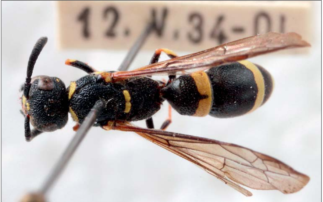
Slika 53: Symmorphus declivis , samica iz Olimja pri Podčetrtku, ujeta 12. maja 1934.

Figure 53: Symmorphus declivis female from Olimje near Podčetrtek, collected 12 May 1934.