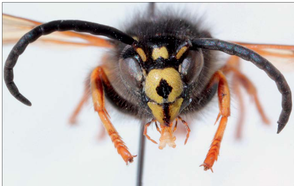
Slika 77: Dolichovespula adulterina , obraz samca s Snežnika.