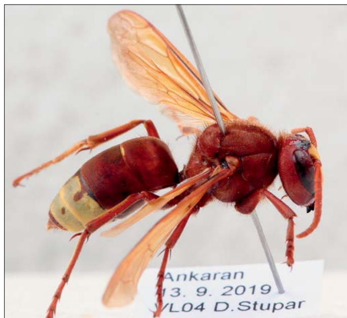
Slika 69: Vespa orientalis , samica iz Ankarana.