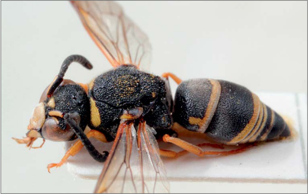
Slika 3: Allodynerus floricola , samec z Brij pri Komnu na Krasu.