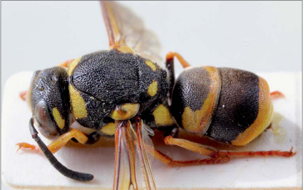
Slika 30: Euodynerus curictensis , samica z Brij pri Komnu.