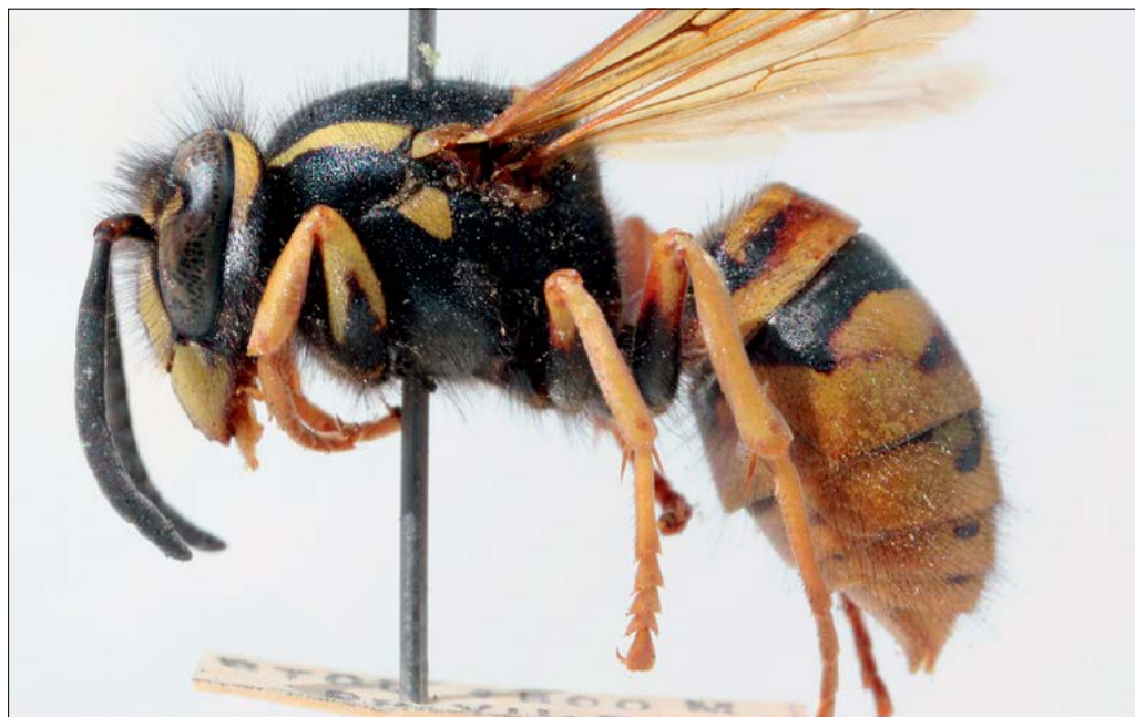
Slika 73: Vespula rufa , samica s Stola v Karavankah.

Figure 72: Vespula germanica female from Lukovica pri Brezovici, collected 8 June 2019.