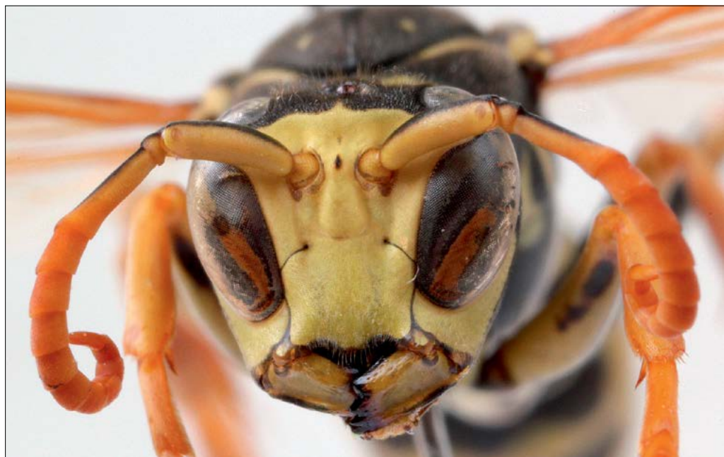
Slika 67: Polistes semenowi , obraz samca s Snežnika.

Figure 66: Face of Polistes semenowi female from Olimje near Podčetrtek, collected 6 September 1932.