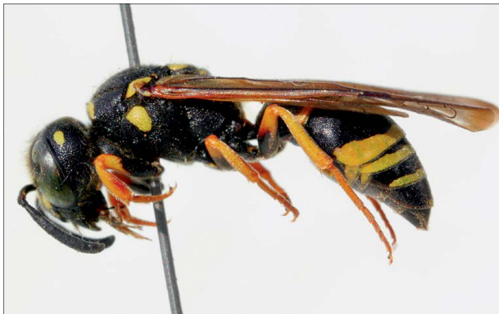
Slika 33: Gymnomerus laevipes , samica iz Podčetrčka, ujeta 10. maja 1934.

Figure 32: Euodynerus quadrifasciatus female from Podčetrtek, collected 27 June 1936.