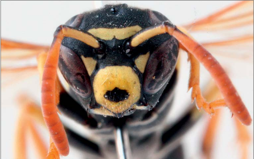
Slika 64: Polistes gallicus , obraz samice iz Levca pri Celju.