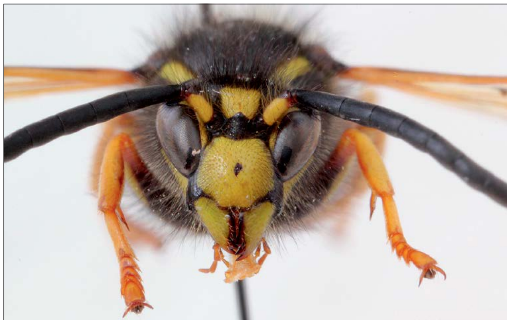
Slika 81: Dolichovespula omissa , obraz samca s Snežnika.