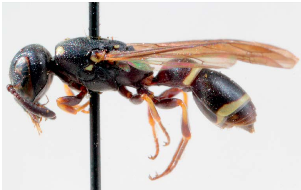
Slika 39: Microdynerus parvulus , samica iz Podčetrčka, ujeta 11. junija 1937.