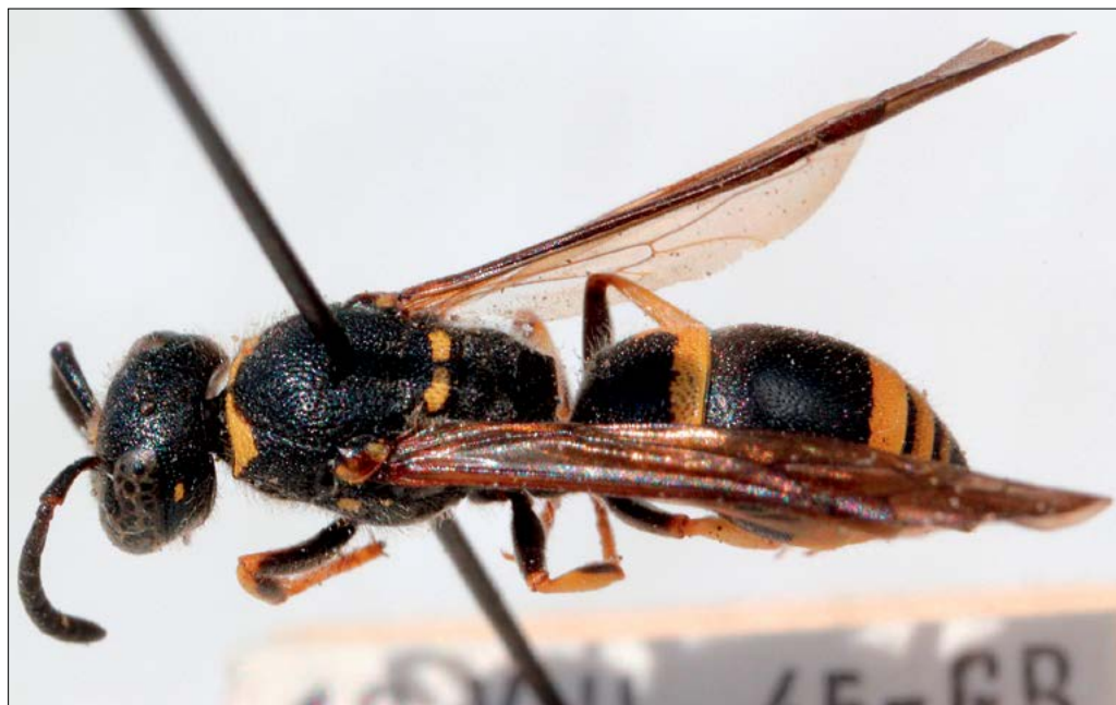
Slika 18: Ancistrocerus trifasciatus , samica iz Podčetrтка, ujeta 18. avgusta 1945.

Figure 17: Ancistrocerus scoticus female from Mt. Tosc in the Julian Alps.