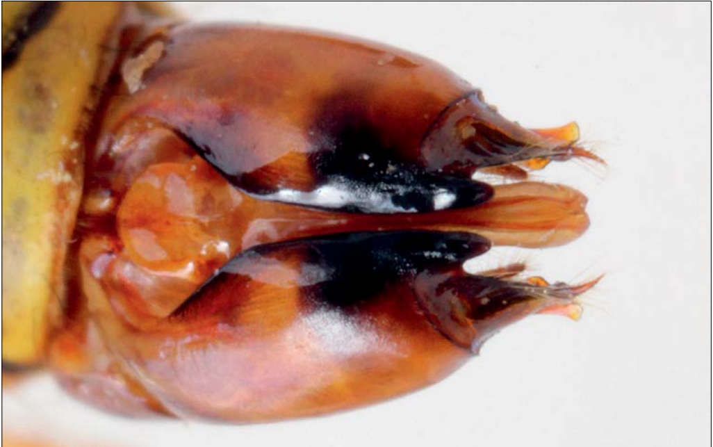
Slika 86: Dolichovespula sylvestris , genitalije samca.