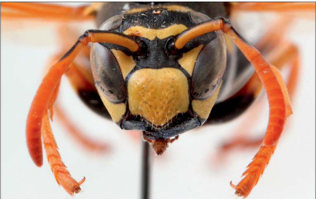
Slika 61: Polistes dominula , obraz samice iz Lukovca na Krasu.