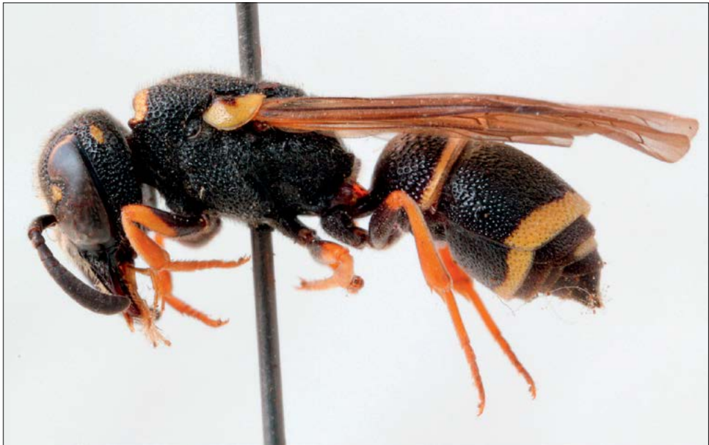
Slika 1: Alastor mocsaryi , samica iz Podčetrтка, ujeta 17. junija 1935.

Podčetrtek, WM41, 1.–10. 7. 1933, 1♂, 17. 6. 1935, 1♀, VIR (Virštanj) 19. 6. 1945, 1♀, E. Jaeger leg., PMSL