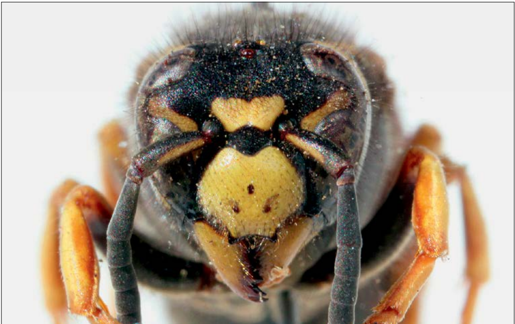
Slika 71: Vespula austriaca , obraz samice.