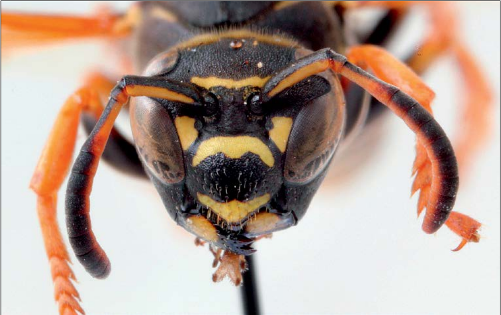
Slika 60: Polistes biglumis , obraz samice z Nanosa.