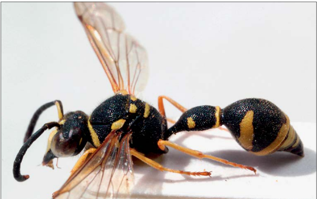
Slika 29: Eumenes pomiformis , samec z Brij pri Komnu.