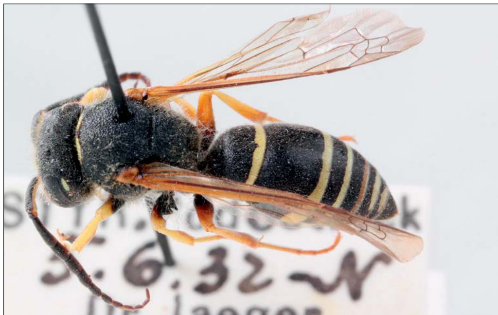
Slika 42: Odynerus melanocephalus , samec iz Podčetrtek, ujet 5. junija 1932.

Figure 41: Odynerus poecilus female entering her nest through the chimney. Mt. Kavčič, 19 May 2007.