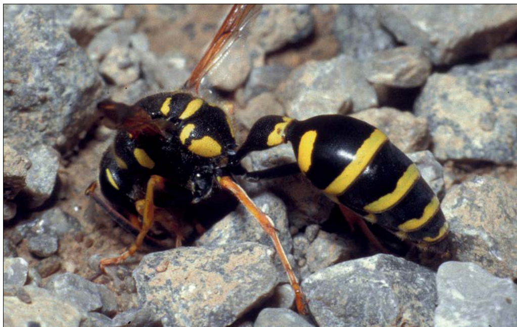
Slika 35: Katamenes arbustorum , samica zbira pesek za gradnjo gnezda. Brje pri Komnu, 17. junija 1989.