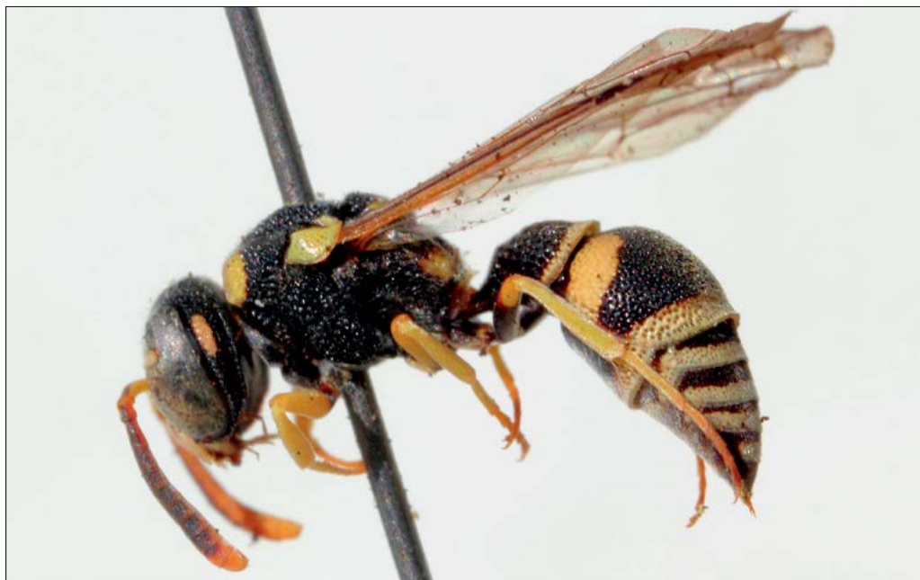
Slika 34: Jucancistrocerus jucundus , samec iz Podčetrška, ujet 2. avgusta 1932.