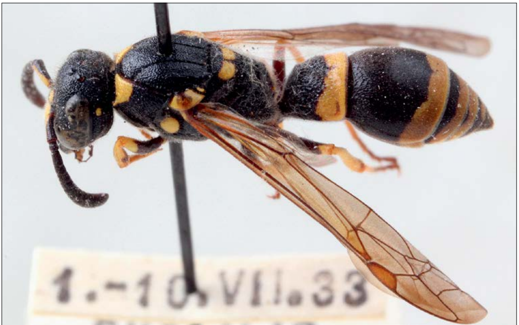
Slika 54: Symmorphus gracilis , samica iz Podčetrтка, ujeta 1.-10. julija 1933.

Figure 53: Symmorphus declivis female from Olimje near Podčetrtek, collected 12 May 1934.