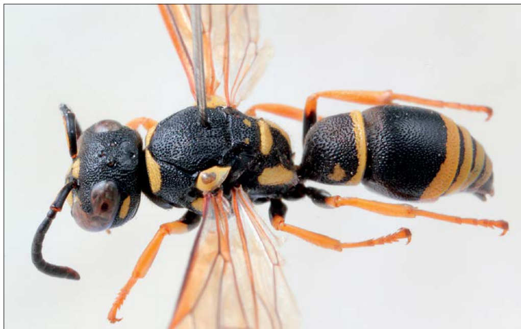
Slika 2: Allodynerus delphinalis , samica z Nanosa.

Brje pri Komnu, VL07, 13. 5. 1990, 1♂, A. Gogala leg., PMSL