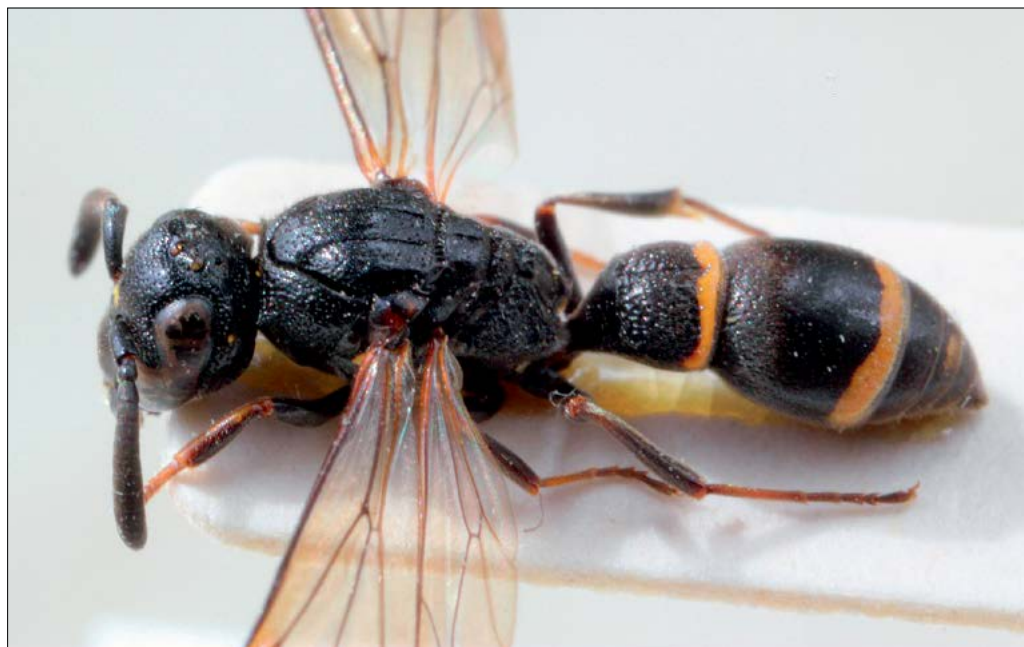
Slika 52: Symmorphus debilitatus , samica z Lukovice pri Brezovici, ujeta 17. julija 1990.

Figure 51: Symmorphus crassicornis female from Podčetrtek, collected 14 June 1942.