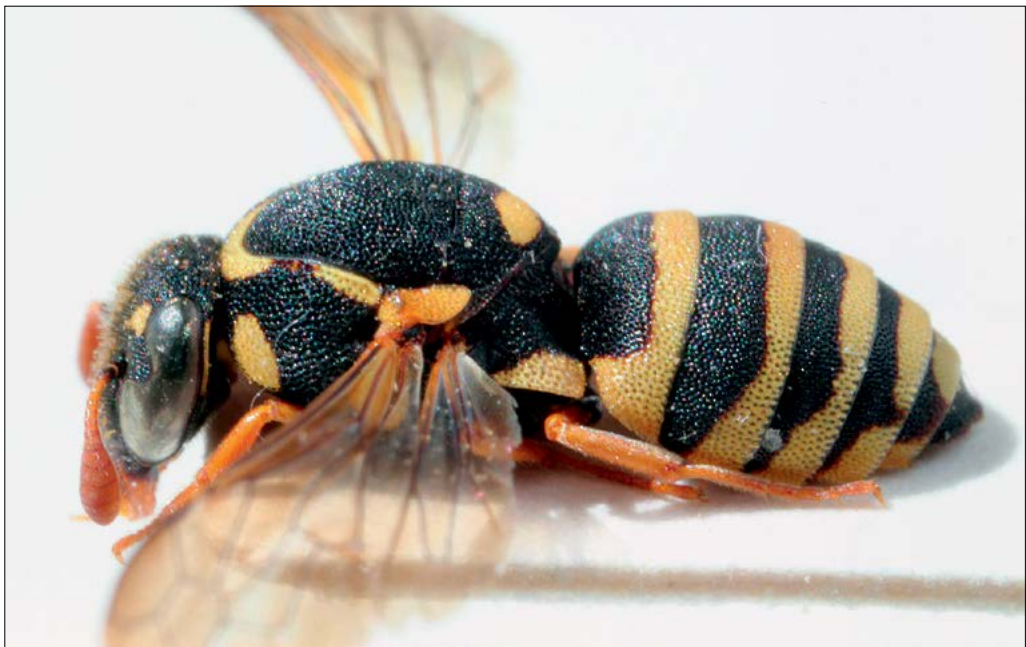
Slika 56: Celonites abbreviatus , samica z Brij pri Komnu na Krasu.