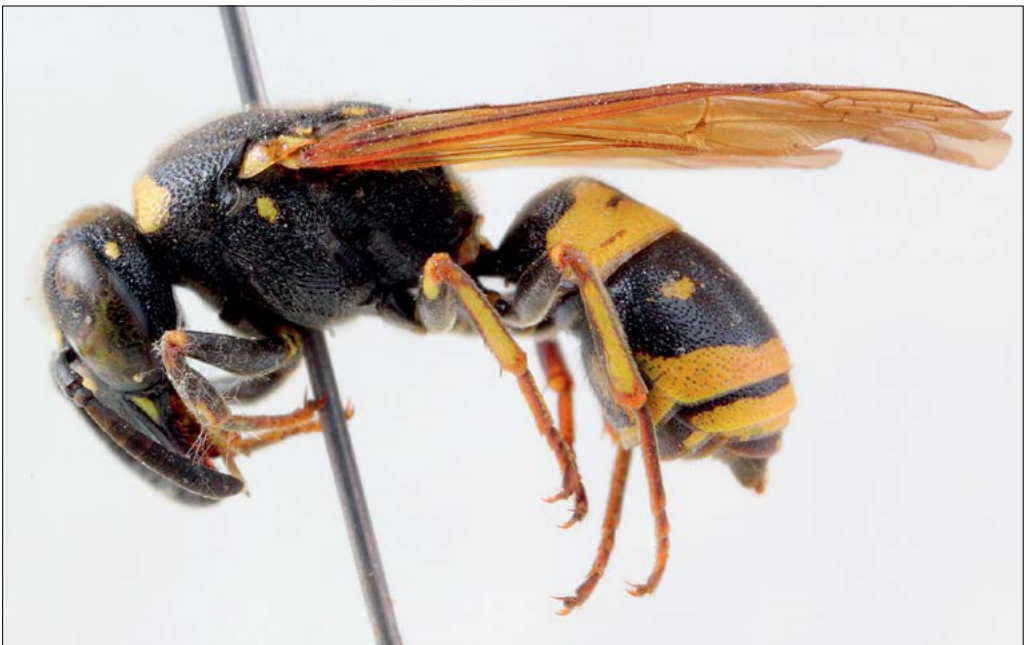
Slika 31: Euodynerus notatus , samica iz Podčetrтка, ujeta 13. junija 1936.