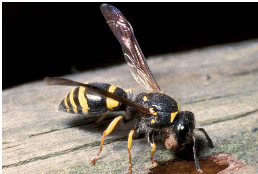
Slika 6: Ancistrocerus nigricornis , samica prinaša blato v gnezdo v hroščjem rovu v lesu. Brje pri Komnu, 5. maj 1989.

Figure 5: Ancistrocerus parietinus female collecting soil for nest construction. Sela na Krasu, 24 May 2020.