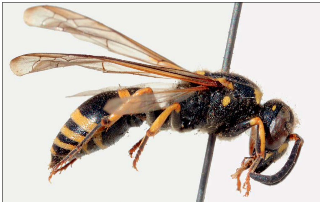
Slika 14: Ancistrocerus parietinus , samica iz Podčetrтка, ujeta 20. -30. junija 1933.