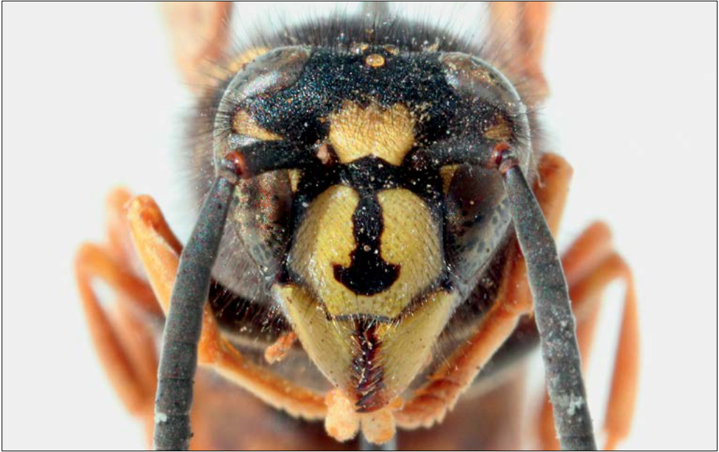
Slika 74: Vespula rufa , obraz samice.