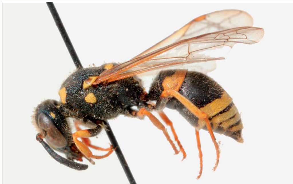
Slika 9: Ancistrocerus claripennis , samica iz Podčetrтка, ujeta 15. julija 1938.

Figure 9: Ancistrocerus claripennis female from Podčetrtek, collected 15 July 1938.