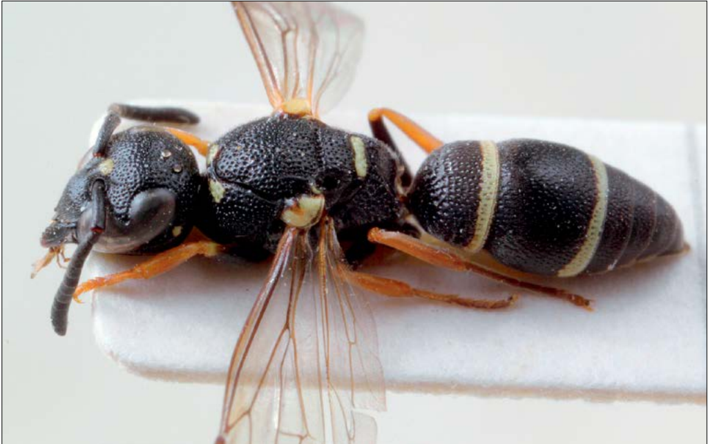
Slika 47: Stenodynerus bluethgeni , samica z Brij pri Komnu na Krasu.