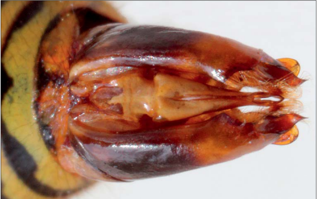
Slika 78: Dolichovespula adulterina , genitalije samca.