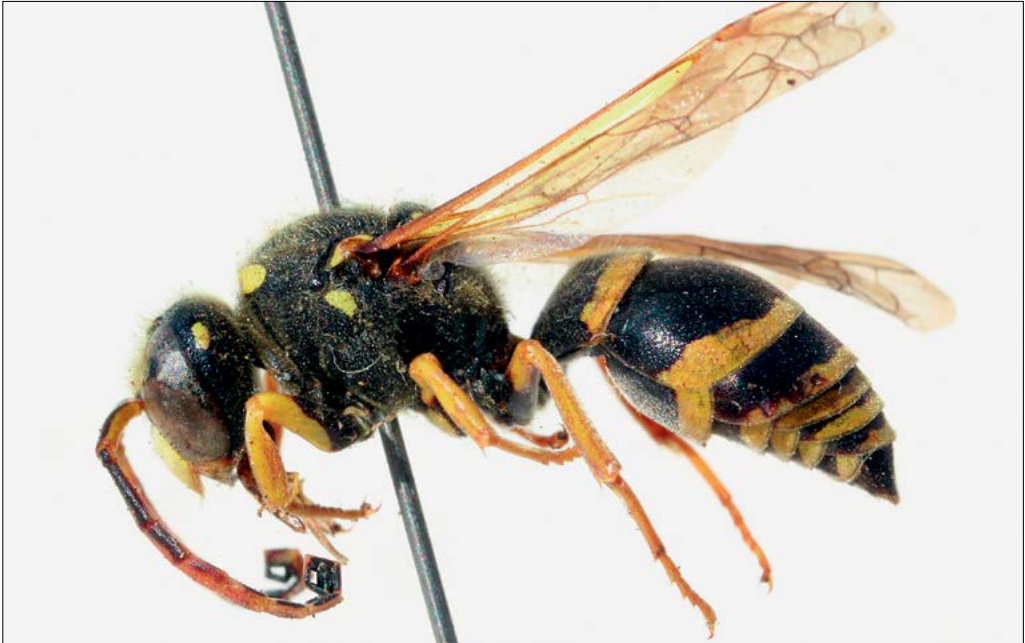
Slika 45: Paragymnomerus spiricornis , samec s Stola v Karavankah.