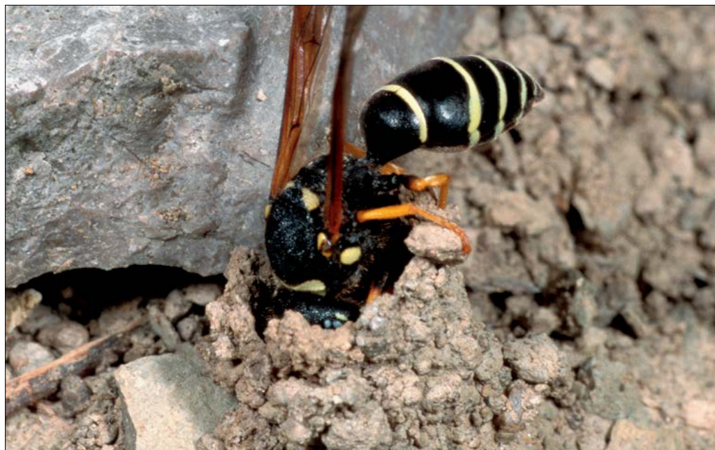
Slika 41: Odynerus poecilus , samica vstopa v gnezdo skozi dimnik. Kavčič, 19. maja 2007.

Figure 41: Odynerus poecilus female entering her nest through the chimney. Mt. Kavčič, 19 May 2007.