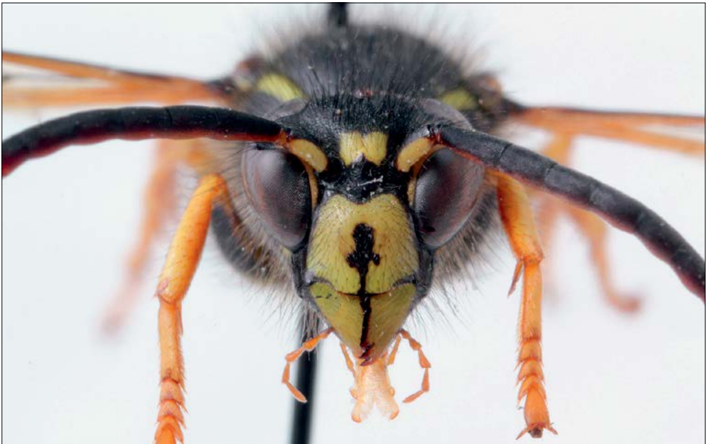
Slika 83: Dolichovespula saxonica , obraz samca iz Drage pri Igu.