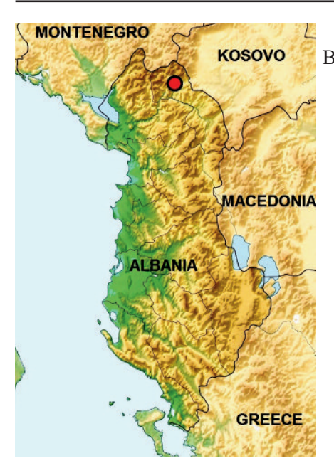
Fig. 1: Sampling site in Sylbicë village in Bjeshkët e Nemuna in Albania.