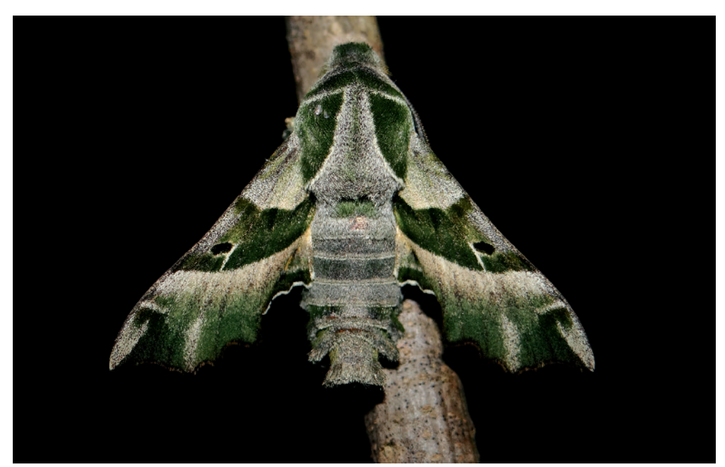
Fig. 1: Proserpinus proserpina from the island Dugi Otok, Croatia.

Sl. 1: Proserpinus proserpina z otoka Dugi otok, Hrvaška.